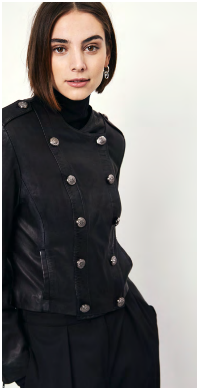
D6AMES LEATHER JACKET D6YALENA HALTER KNIT D6DOYLE PANTS