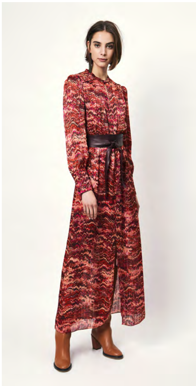
D6SHADOW DRESS D6ALLEGRA LEATHER BELT D6WILLOW LEATHER KNEE BOOTS