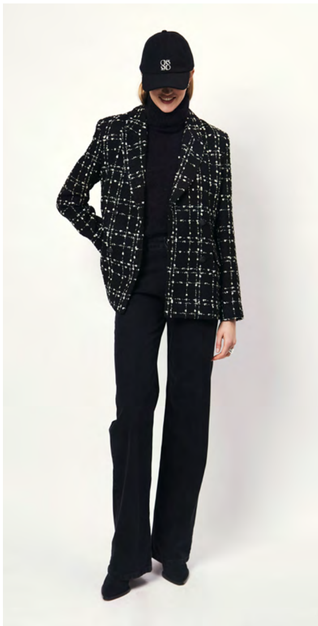
D6PEARSON BLAZER D6YALENA HALTER KNIT D6NADJA JEANS D6FALL CAP D6SIOUX SUEDE ANKLE BOOTS