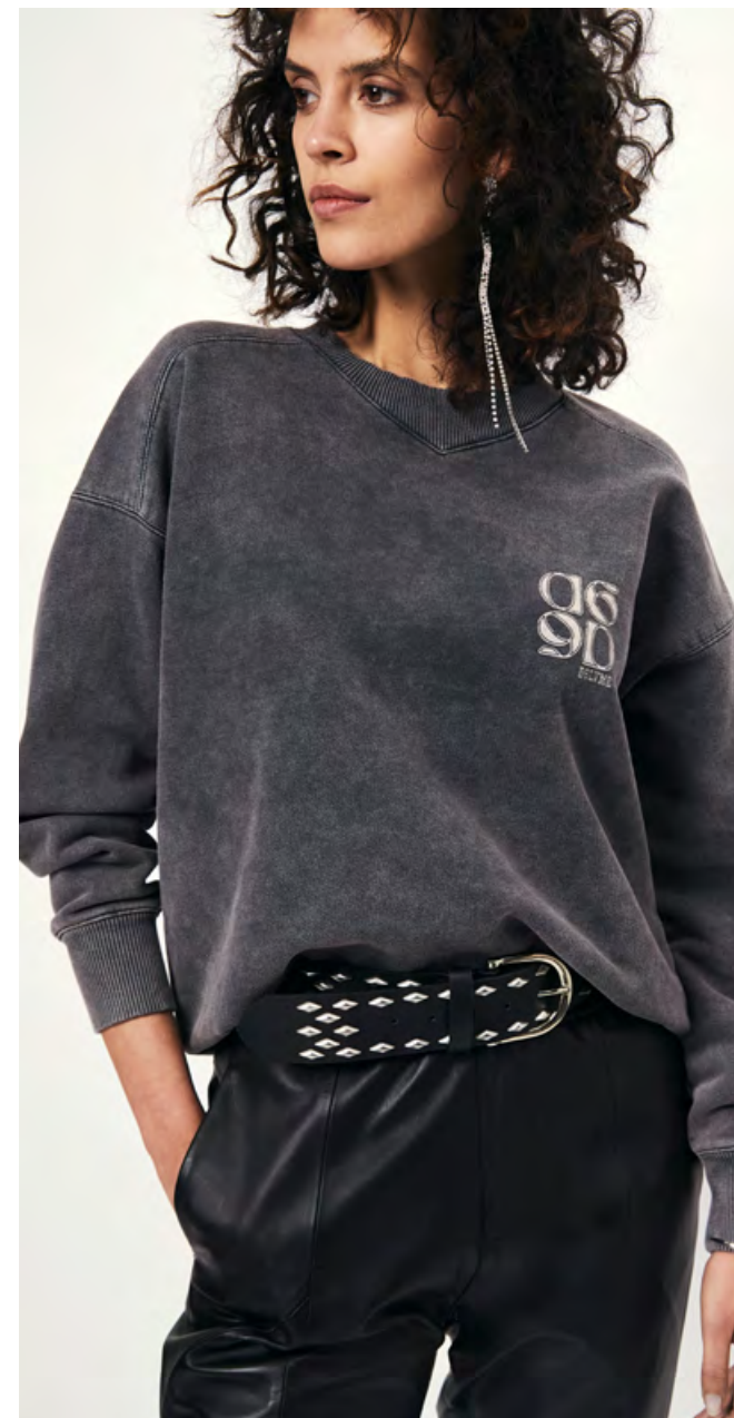
D6RHETT SWEATER D6KUNO LEATHER JOGGER PANTS D6CINQUE LEATHER BELT