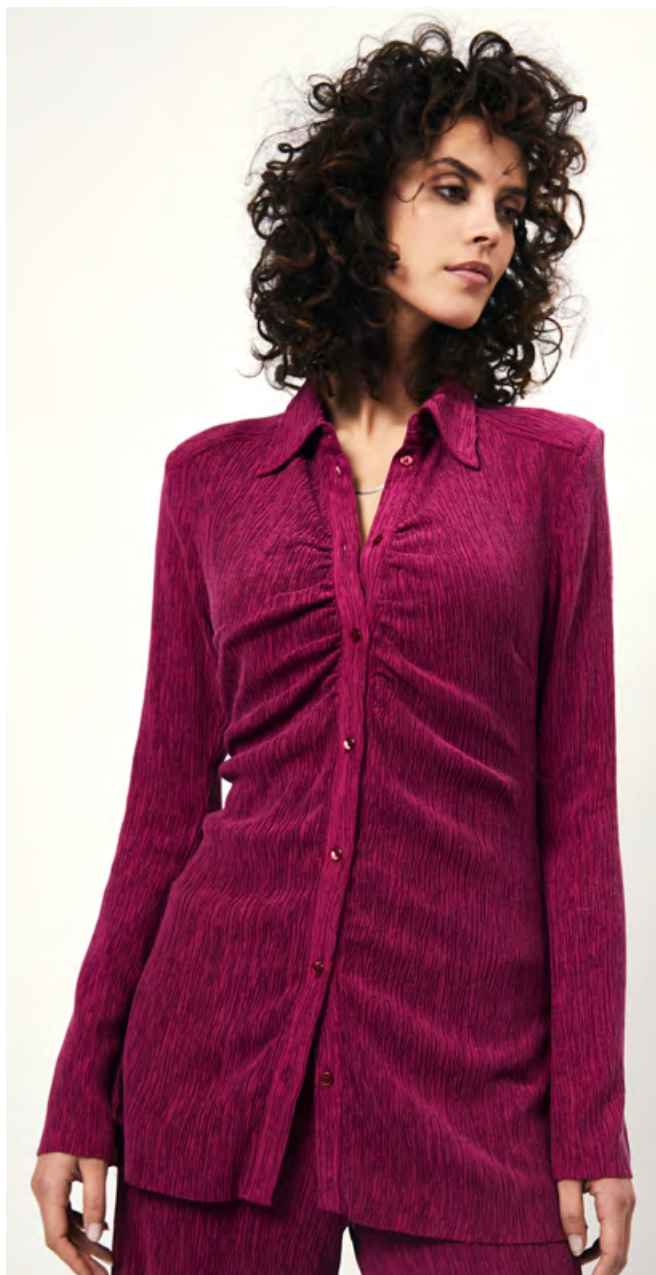
D6CANDICE SHIRT D6HOYS PANTS