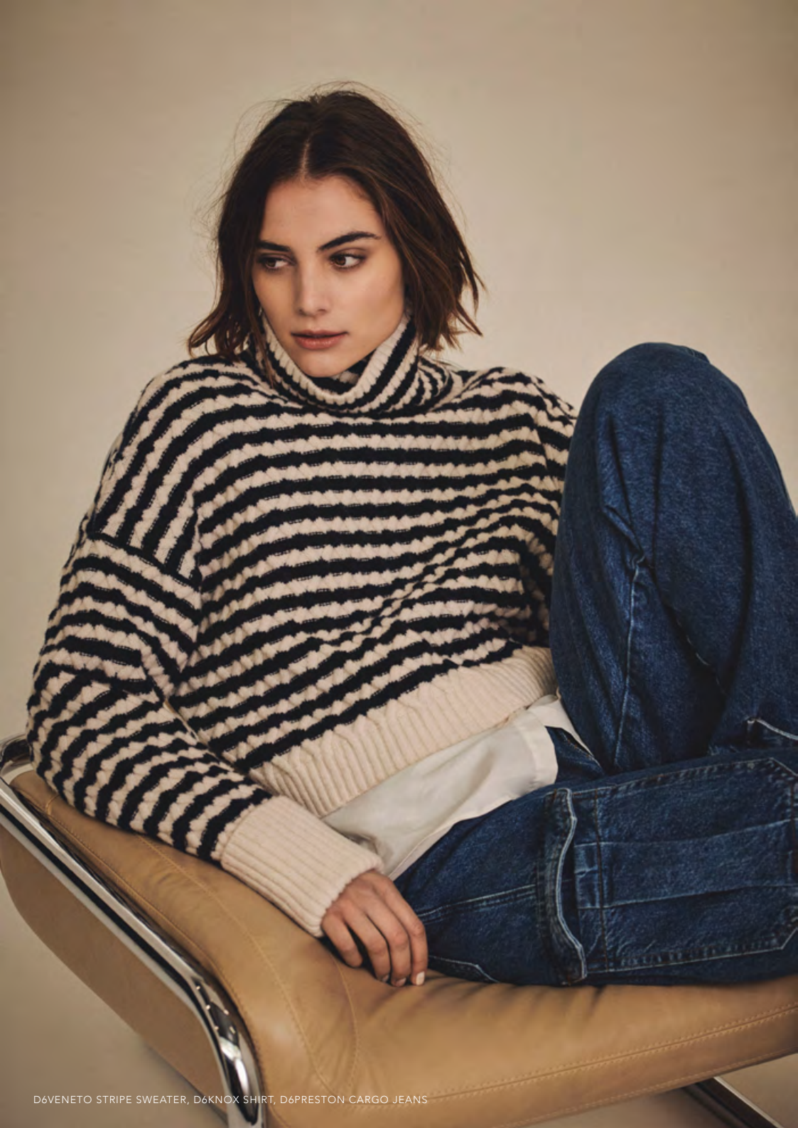
D6VENETO STRIPE SWEATER, D6KNOX SHIRT, D6PRESTON CARGO JEANS