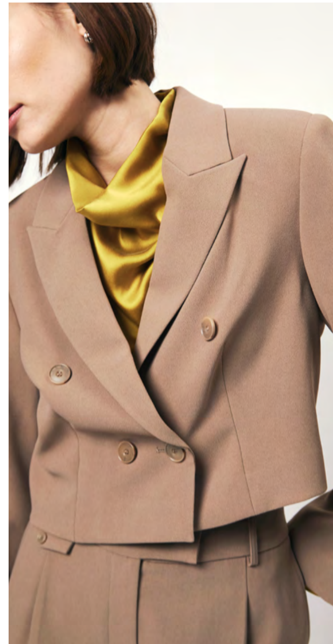
D6MALACHI CROPPED BLAZER D6IPSUM TOP D6ZACH PANTS