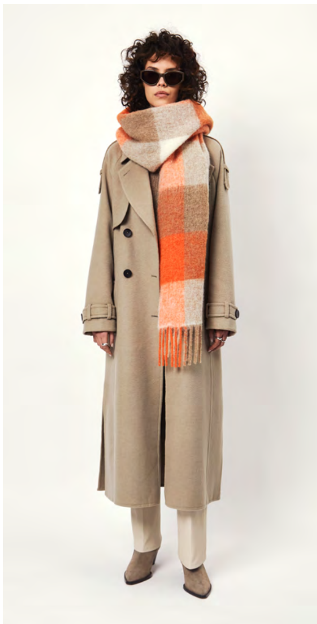
D6RANGER TRENCHCOAT D6TYSON STRETCH LEATHER PANTS D6SIOUX SUEDE ANKLE BOOTS