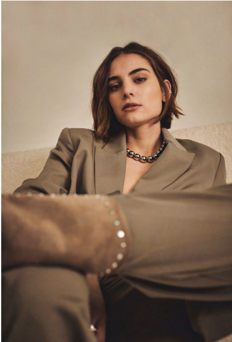
D6LIRIO BLAZER, D6HARLOW CARGO PANTS, D6GINGER SUEDE STUDED BOOTS