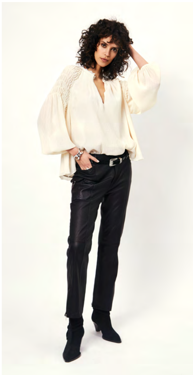
D6AUBREY BLOUSE D6RYDER LEATHER CARGO PANTS D6BRUNELLE SUEDE BELT D6SIOUX SUEDE ANKLE BOOTS