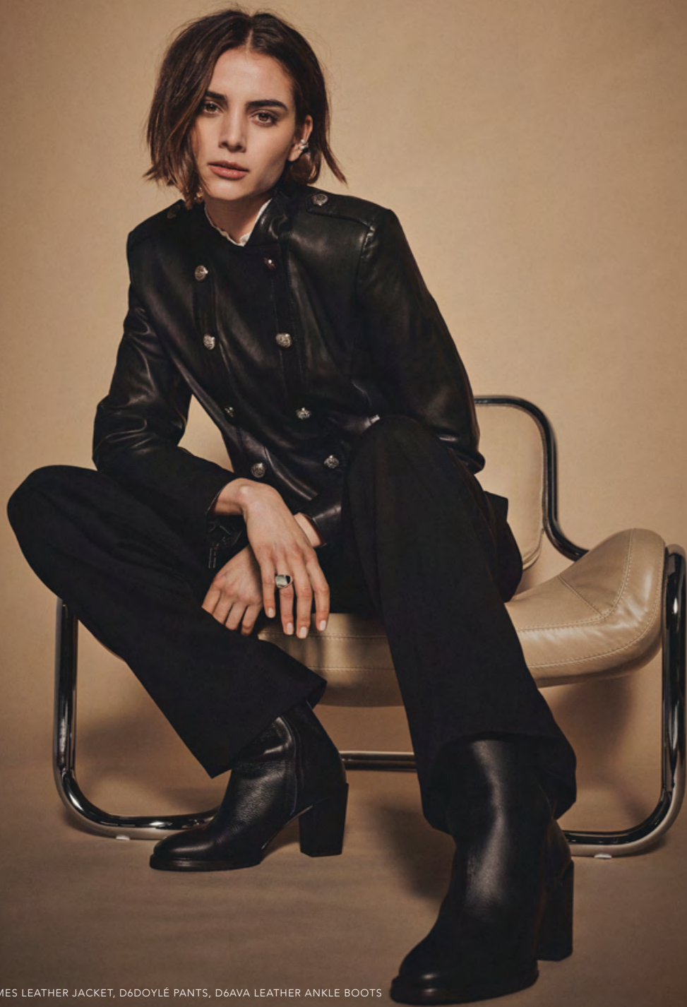
D6AMES LEATHER JACKET, D6DOYLÉ PANTS, D6AVA LEATHER ANKLE BOOTS