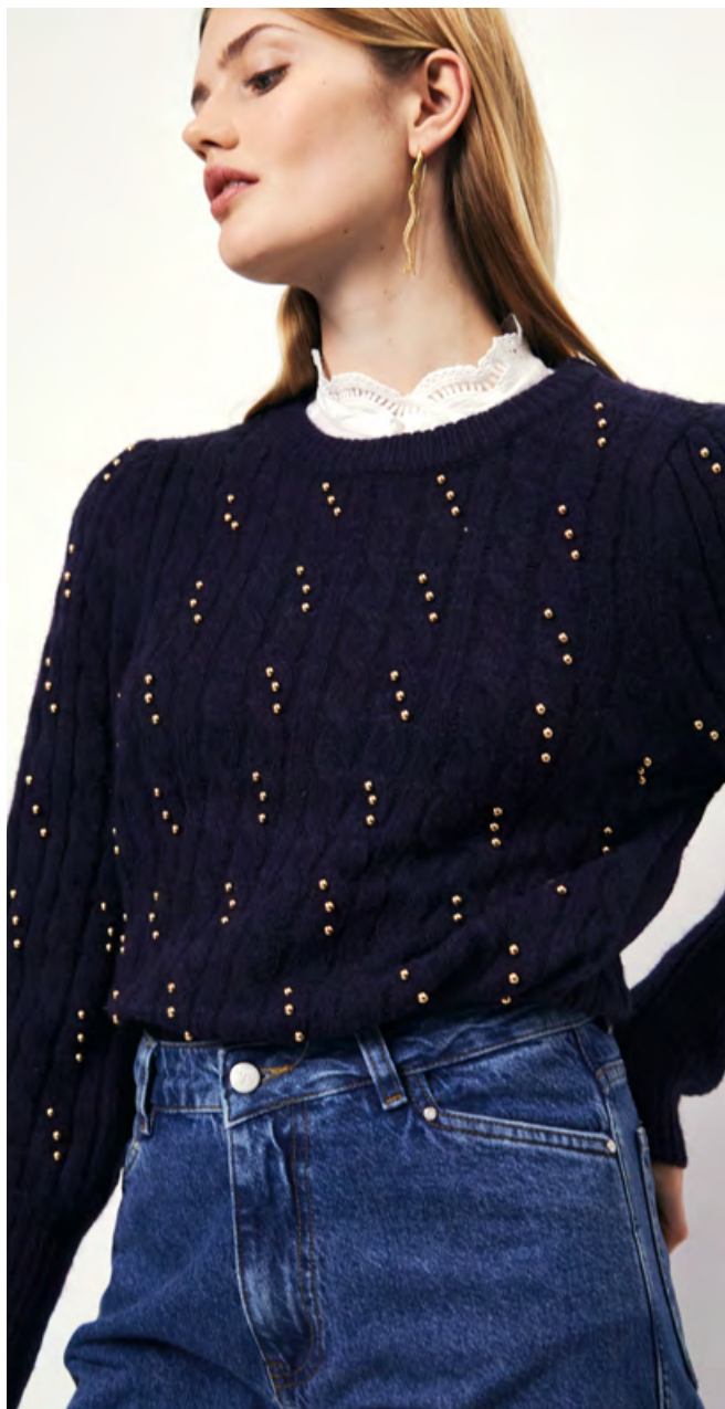
D6OSTIN SWEATER D6RHEA BLOUSE D6PRESTON CARGO JEANS