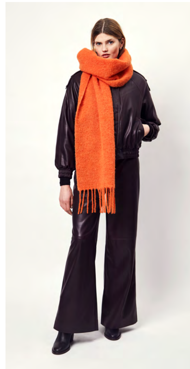
D6ELVIS FAUX LEATHER BOMBER JACKET D6ARIZONA SCARF D6BASKERVILLE FAUX LEATHER PANTS D6AVA LEATHER ANKLE BOOTS