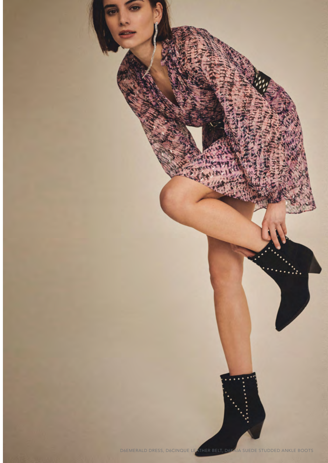
D6EMERALD DRESS, D6CINQUE LEATHER BELT, D6RAIA SUEDE STUDDED ANKLE BOOTS