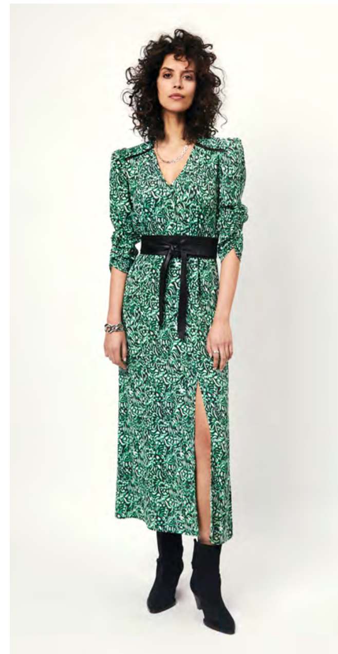
D6IRVING DRESS D6ALLEGRA LEATHER BELT D6SIOUX SUEDE ANKLE BOOTS