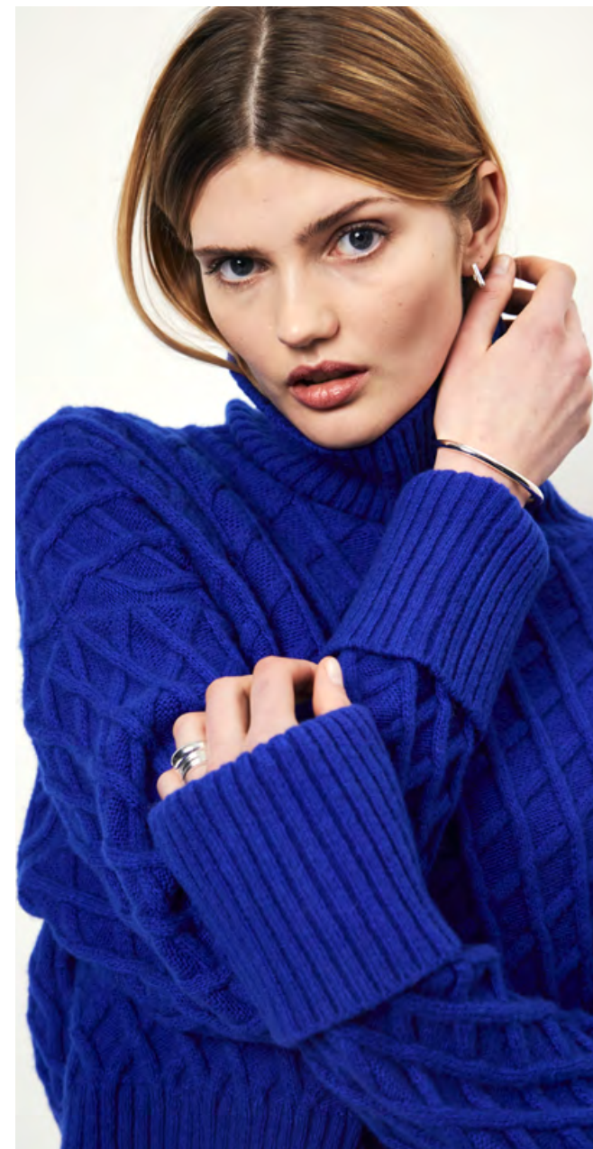
D6VENETO SOLID SWEATER