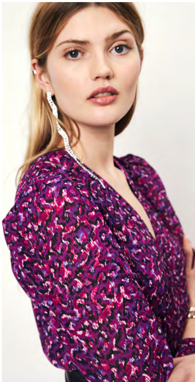
D6VYANA MAXI DRESS