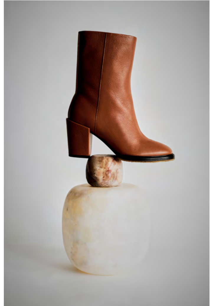
D6AVA LEATHER ANKLE BOOTS