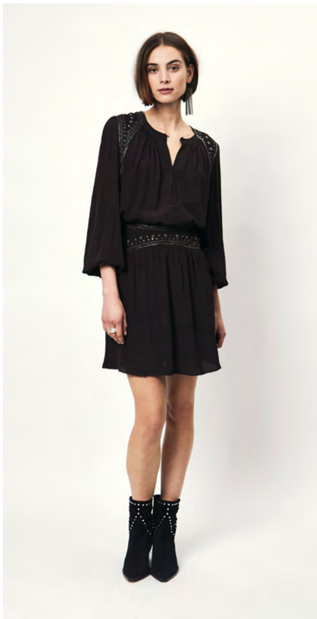
D6ZVI BLOUSE D6NIROKA SKIRT D6KAIA SUEDE STUDED ANKLE BOOTS