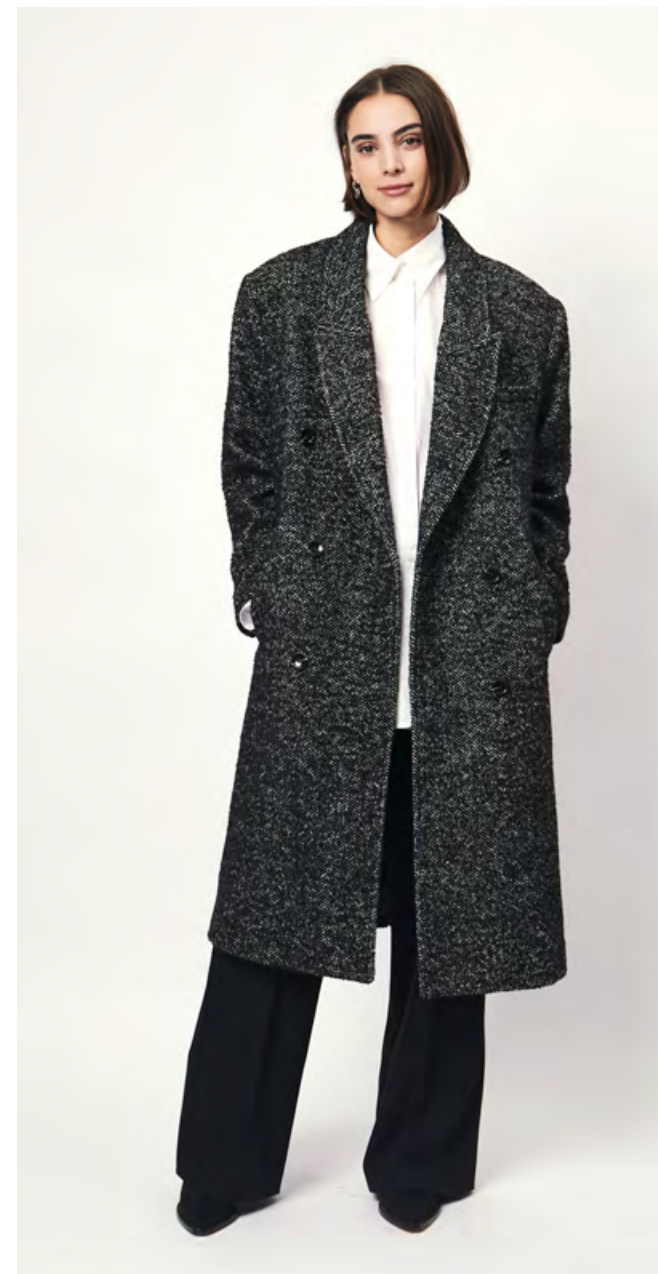
D6RUE COAT D6ETHAN SHIRT D6DOYLÉ PANTS D6SIOUX SUEDE ANKLE BOOTS