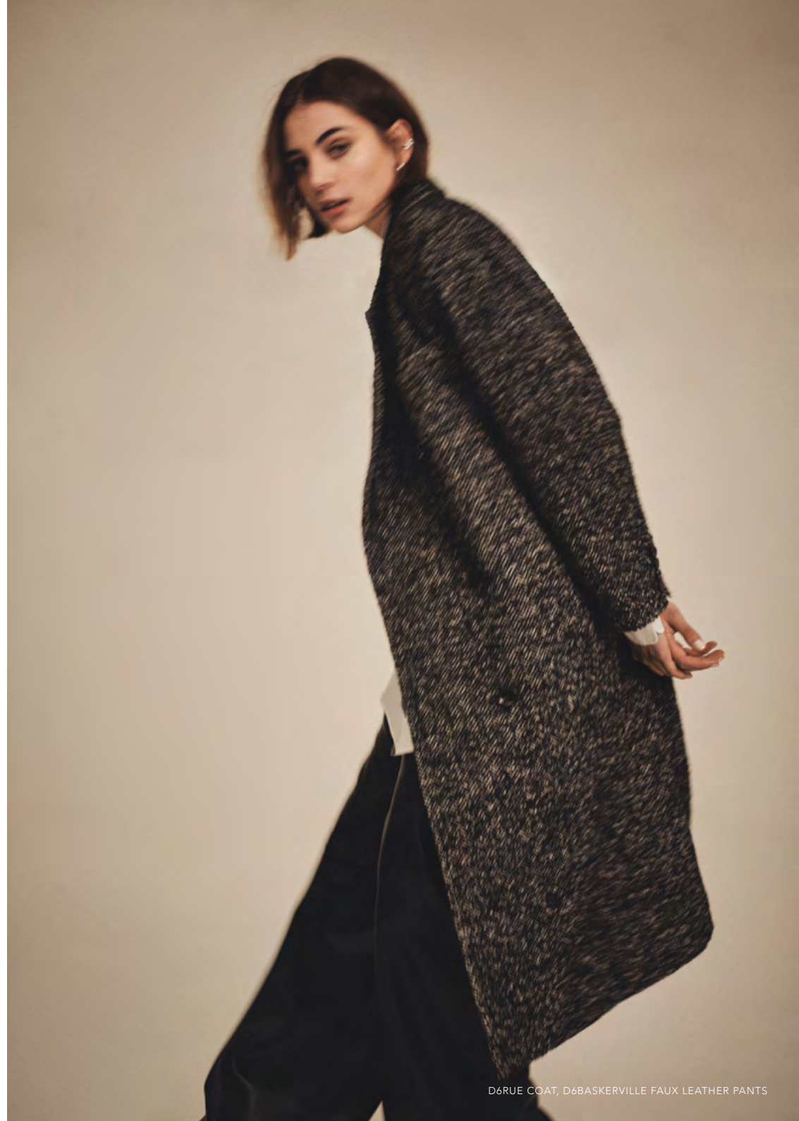
D6RUE COAT, D6BASKERVILLE FAUX LEATHER PANTS