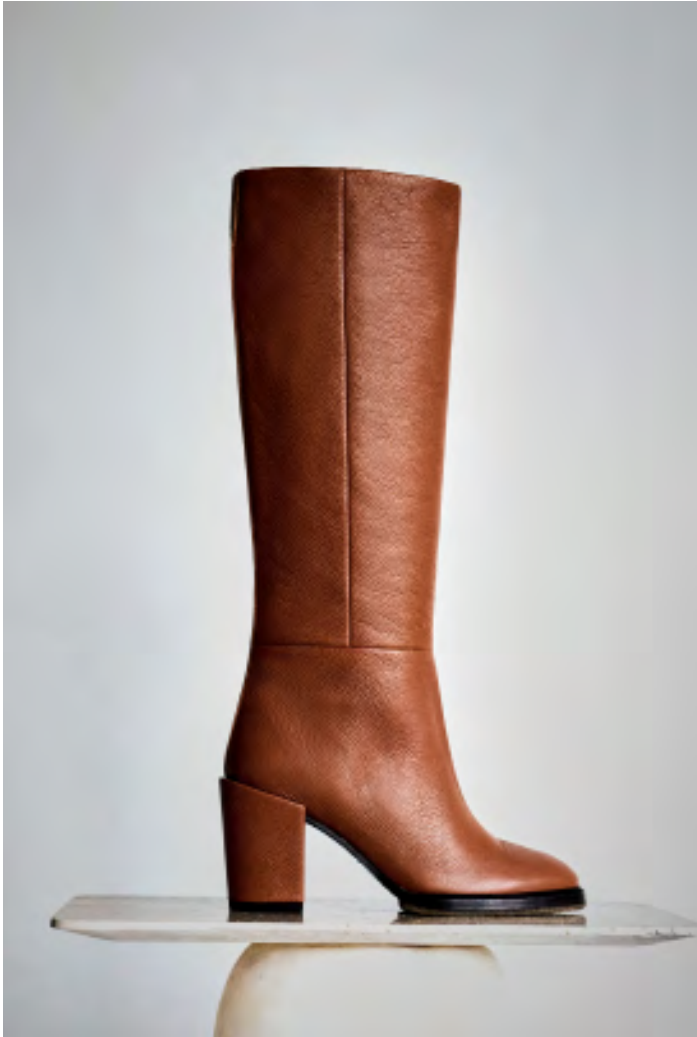
D6WILLOW KNEE BOOTS