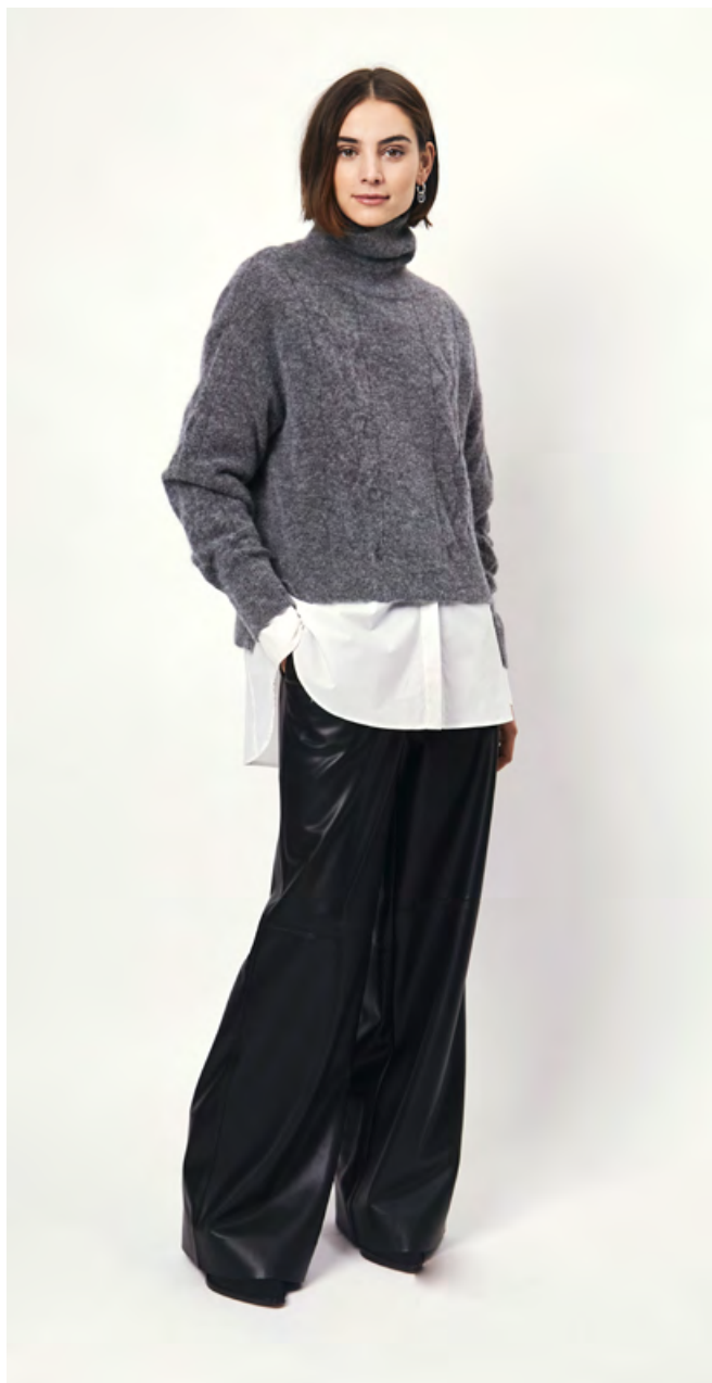
D6TOKYO SWEATER D6ETHAN SHIRT D6BASKERVILLE FAUX LEATHER PANTS D6SIOUX SUEDE ANKLE BOOTS