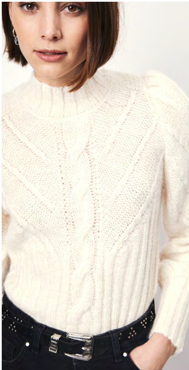
D6AZALEE SWEATER D6NADJA JEANS D6BRUNELLE SUEDE BELT