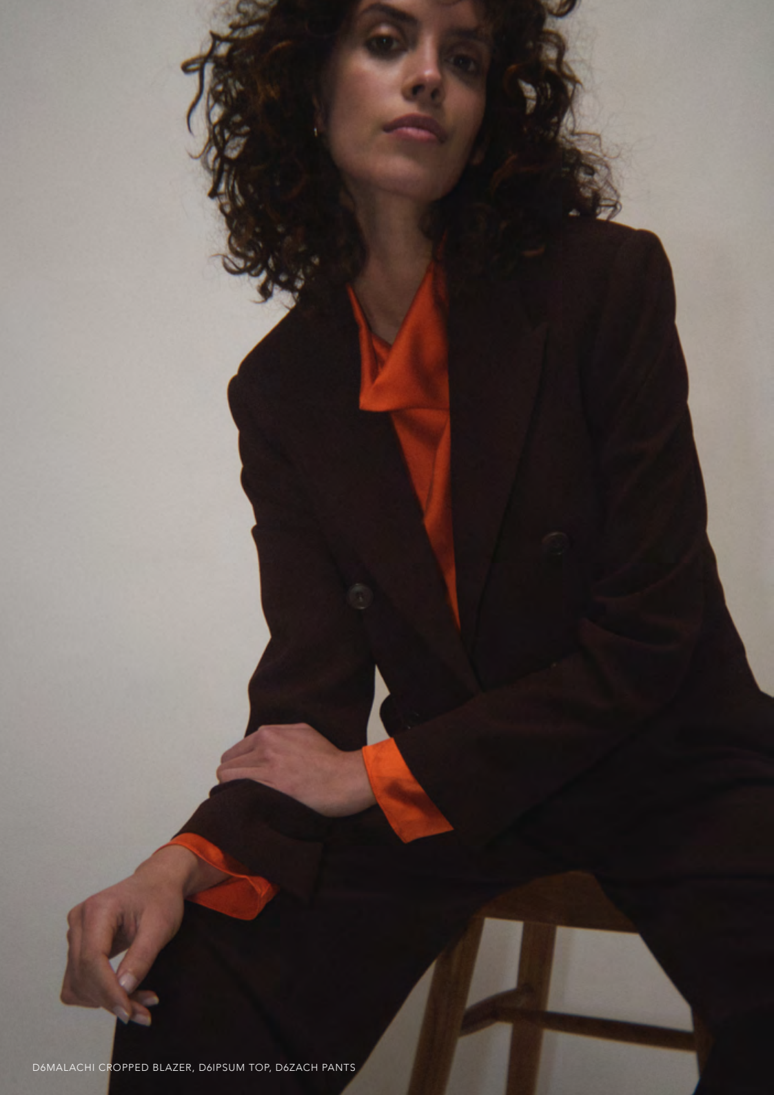
D6MALACHI CROPPED BLAZER, D6IPSUM TOP, D6ZACH PANTS