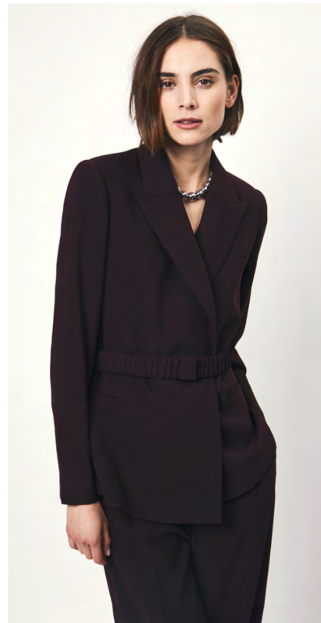
D6MÉMOIRE BELTED BLAZER D6ZACH PANTS