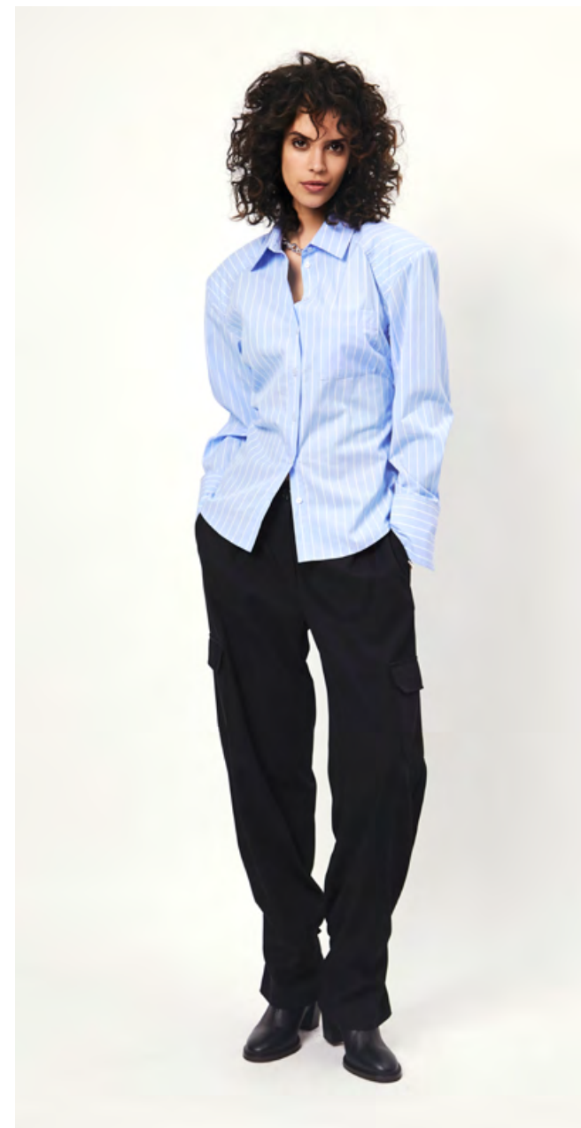
D6MANDELIEU SHIRT D6HARLOW CARGO PANTS D6AVA LEATHER ANKLE BOOTS