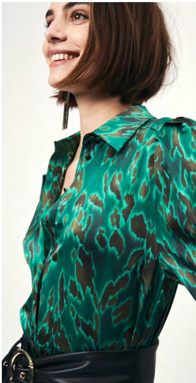
D6MOON DRESS D6JUHL FAUX LEATHER BELT