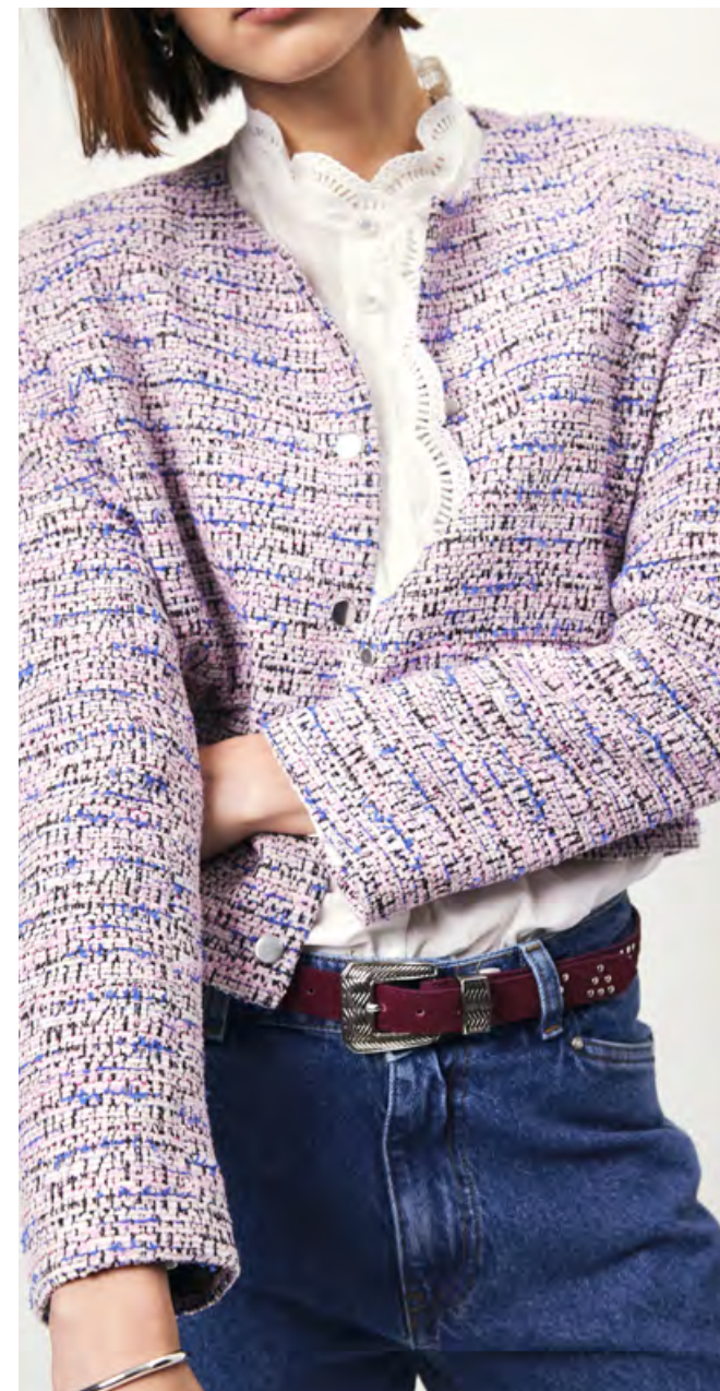
D6ROWAN JACKET D6REA BLOUSE D6PRESTON CARGO JEANS D6BRUNELLE SUEDE BELT