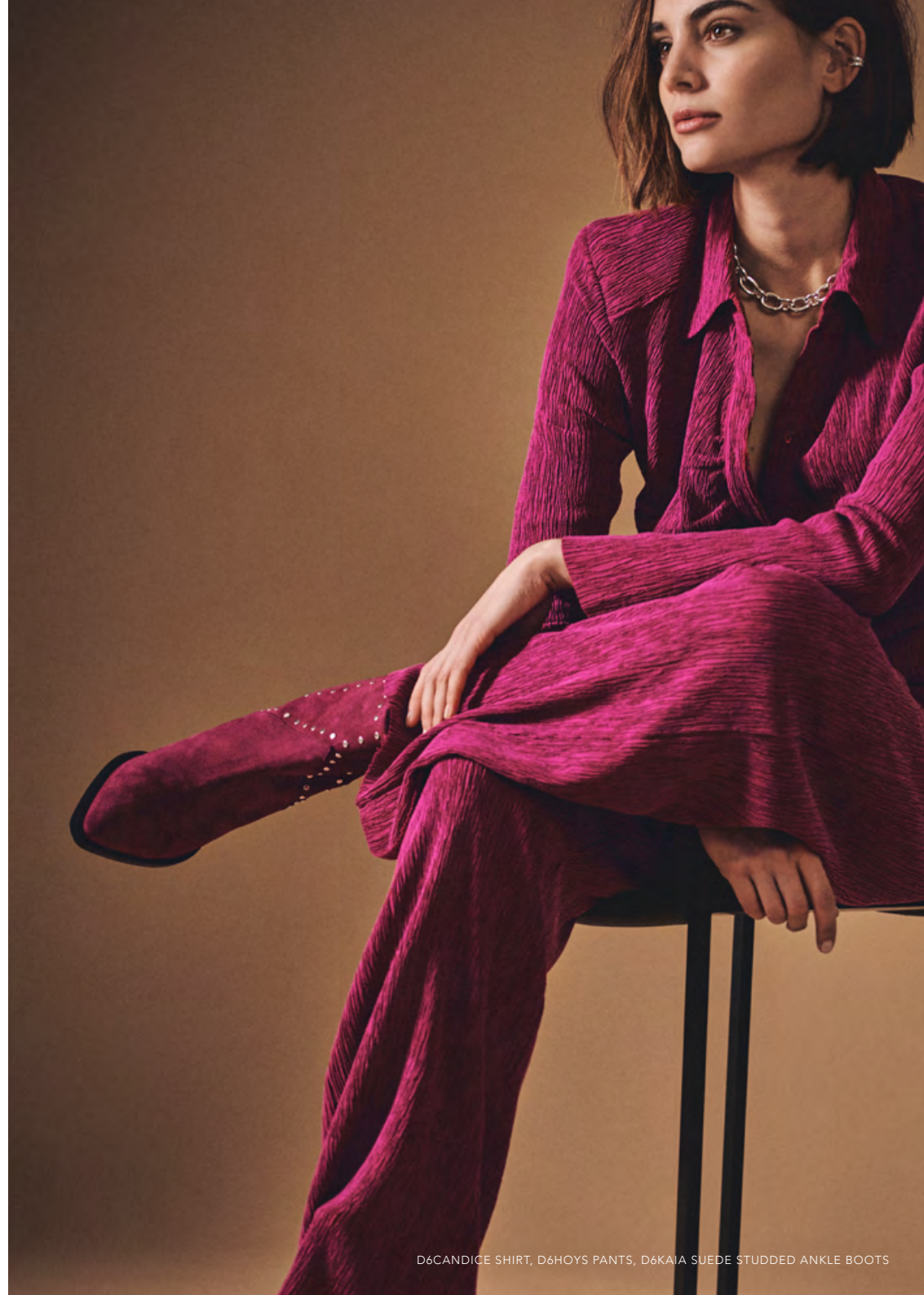
D6CANDICE SHIRT, D6HOYS PANTS, D6KAIA SUEDE STUDED ANKLE BOOTS