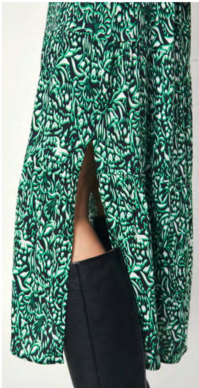
D6HENDRIX MIDI SKIRT D6WILLOW LEATHER KNEE BOOTS