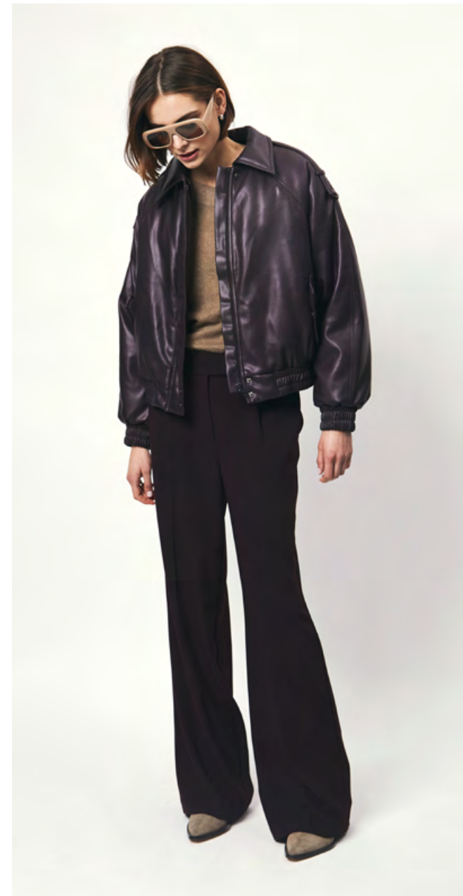
D6ELVIS FAUX LEATHER BOMBER JACKET D6YONKA SWEATER D6ZACH PANTS D6SIOUX SUEDE ANKLE BOOTS