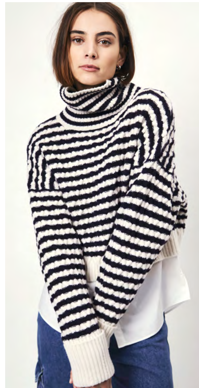
D6VENETO STRIPE SWEATER D6KNOX SHIRT D6PRESTON CARGO JEANS