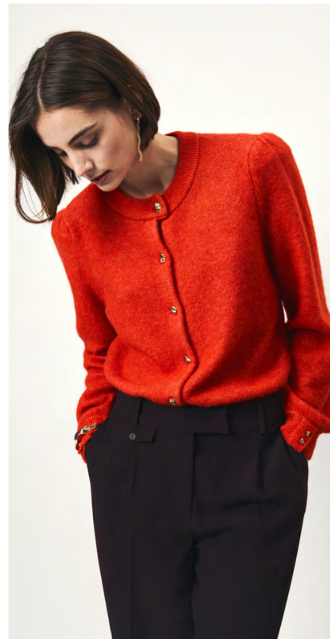
D6ATTICA CARDIGAN D6ZACH PANTS