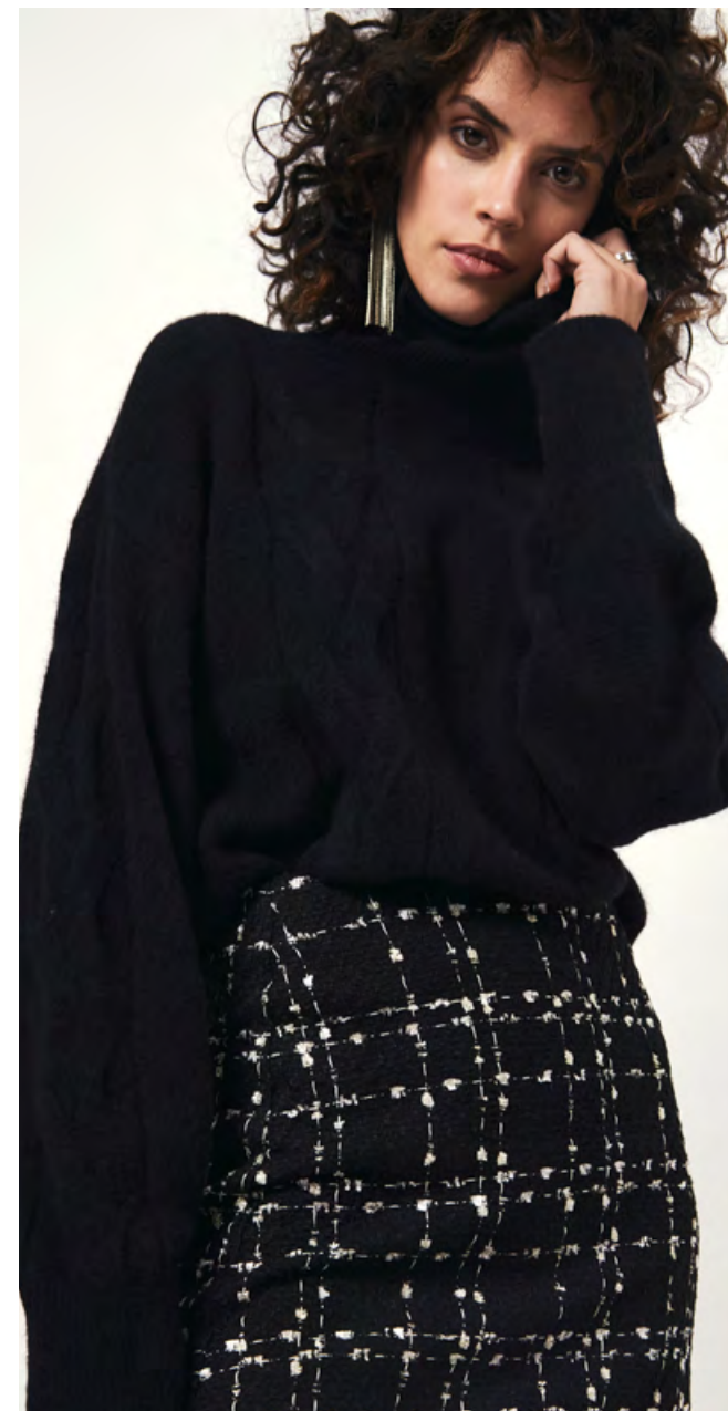
D6TOKYO SWEATER D6JOMBA SHIRT