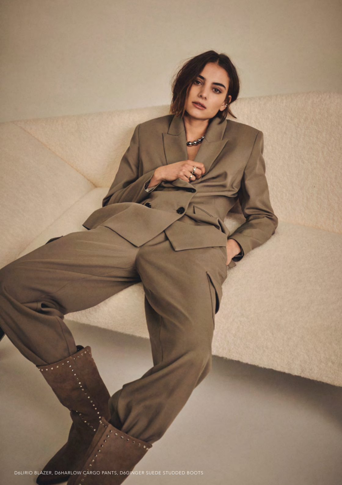
D6LIRIO BLAZER, D6HARLOW CARGO PANTS, D6GINGER SUEDE STUDDED BOOTS