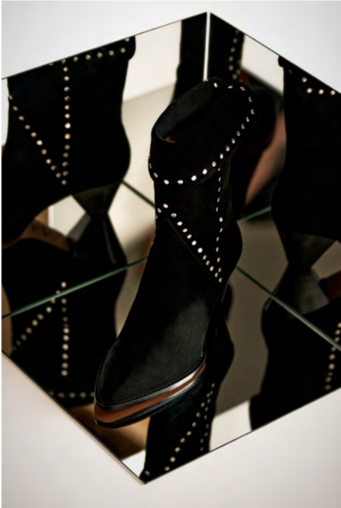
D6KAIA SUEDE STUDED ANKLE BOOTS