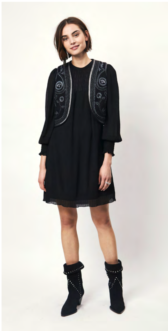
D6DALI GILET D6MERCURY DRESS D6GINGER SUEDE STUDED BOOTS