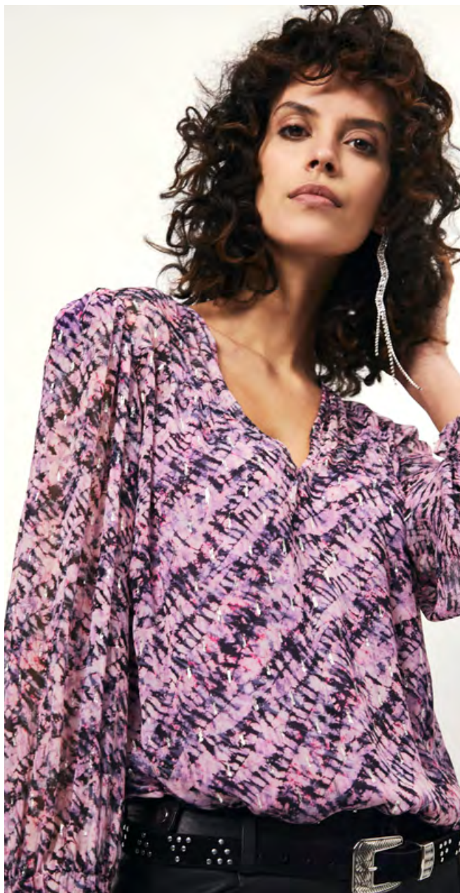
D6AMBER TOP D6RYDER LEATHER CARGO PANTS D6BRUNELLE SUEDE BELT