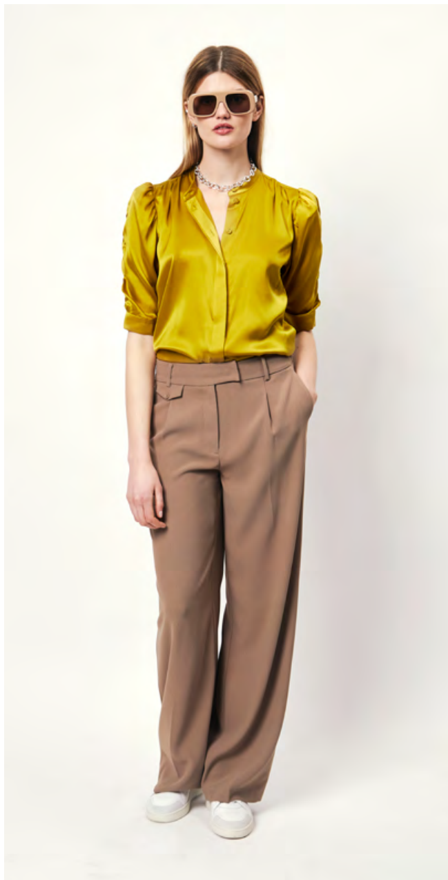
D6PERNAUD BLOUSE D6ZACH PANTS