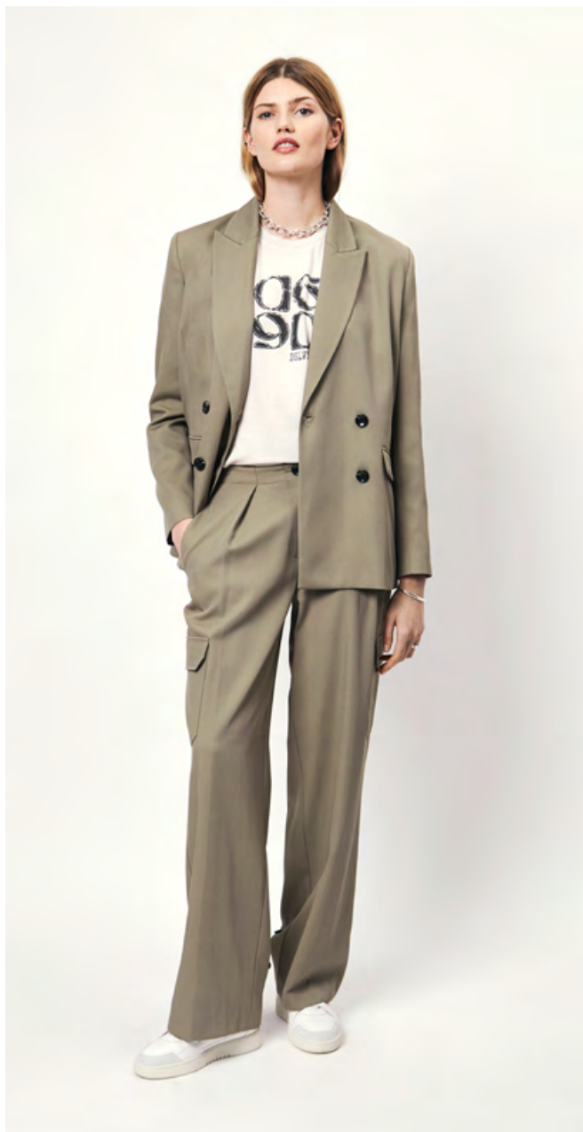
D6LIRIO BLAZER D6ASHTON TEE D6HARLOW CARGO PANTS