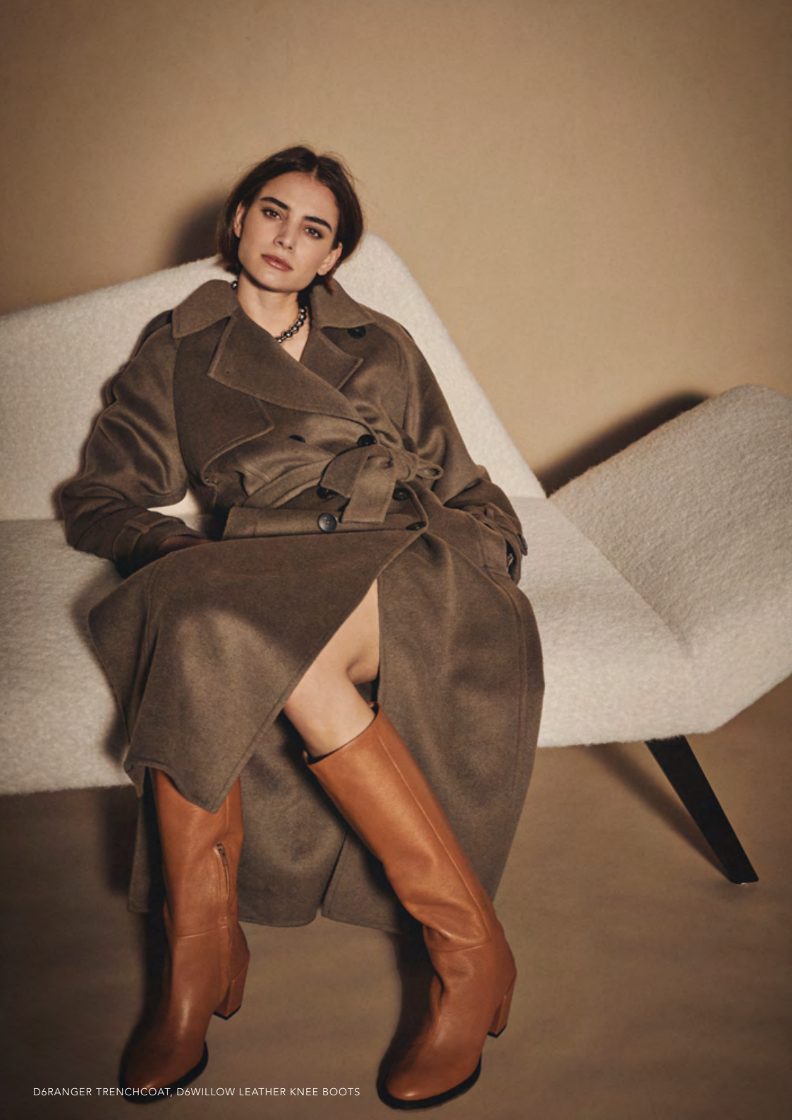
D6RANGER TRENCHCOAT, D6WILLOW LEATHER KNEE BOOTS