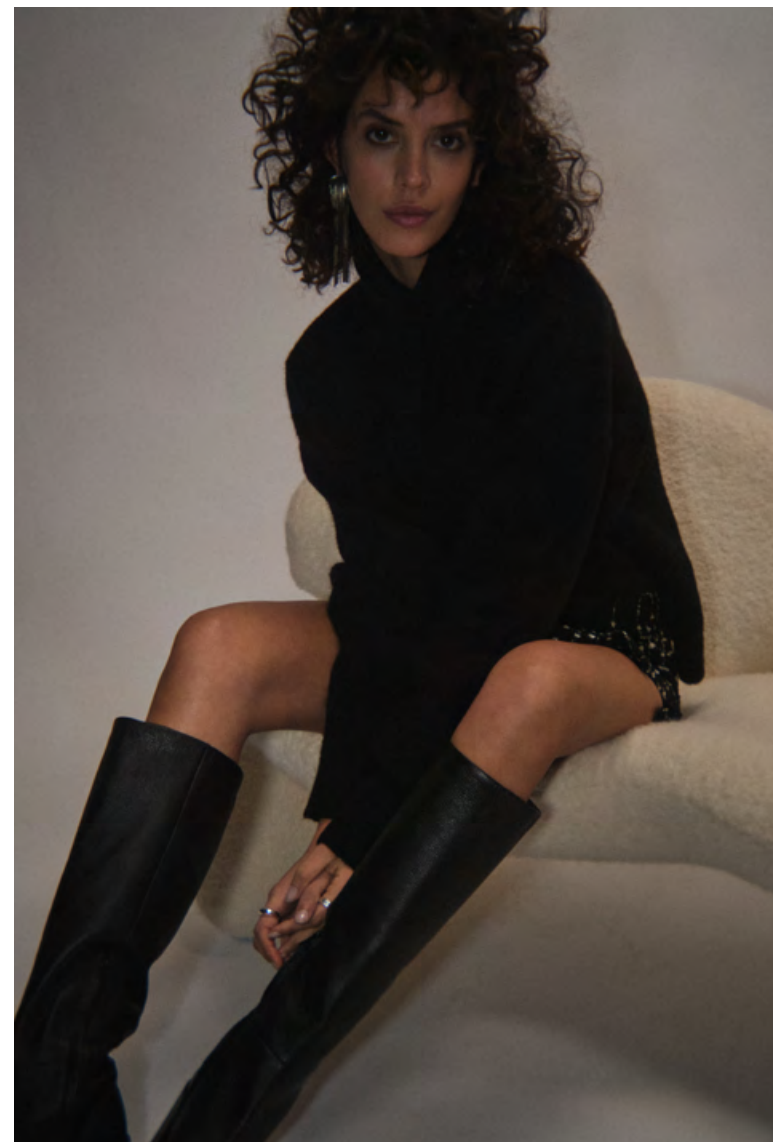
D6TOKYO SWEATER, D6JOMBA SKIRT, D6WILLOW LEATHER KNEE BOOTS