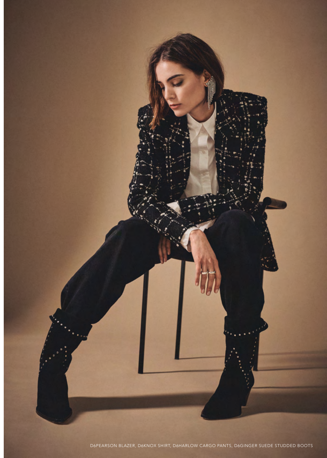
D6PEARSON BLAZER, D6KNOX SHIRT, D6HARLOW CARGO PANTS, D6GINGER SUEDE STUDED BOOTS