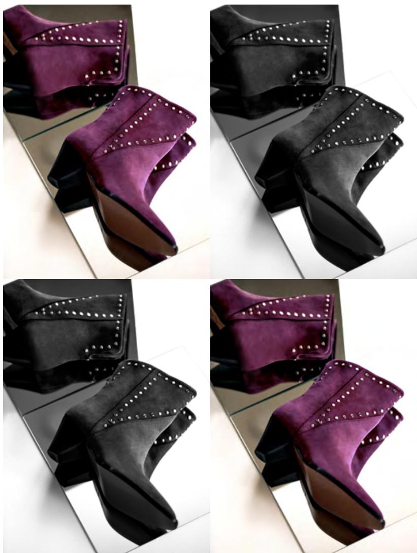
D6KAIA SUEDE STUDED ANKLE BOOTS