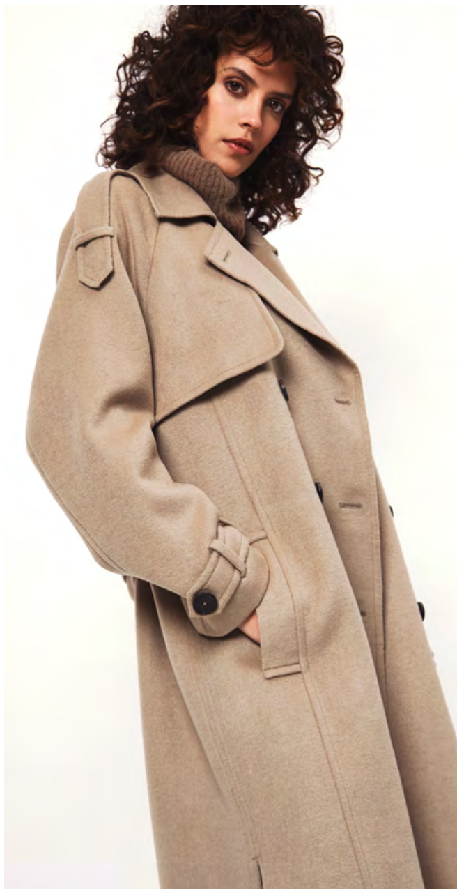
D6RANGER TRENCHCOAT D6YALENA HALTER KNIT