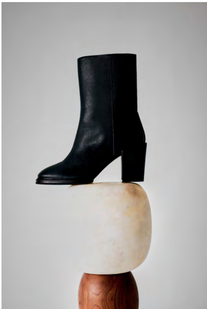
D6AVA LEATHER ANKLE BOOTS