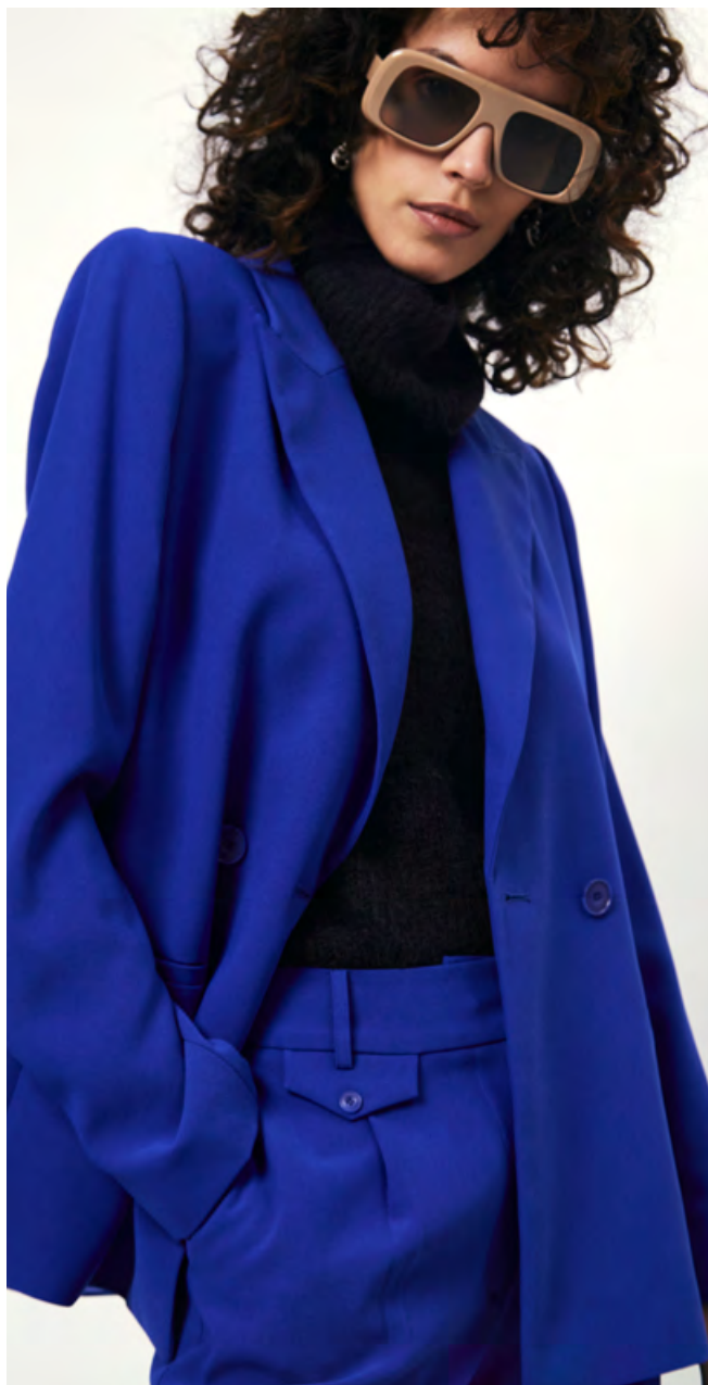
D6MÉMOIRE BLAZER D6YALENA HALTER KNIT D6ZACH PANTS