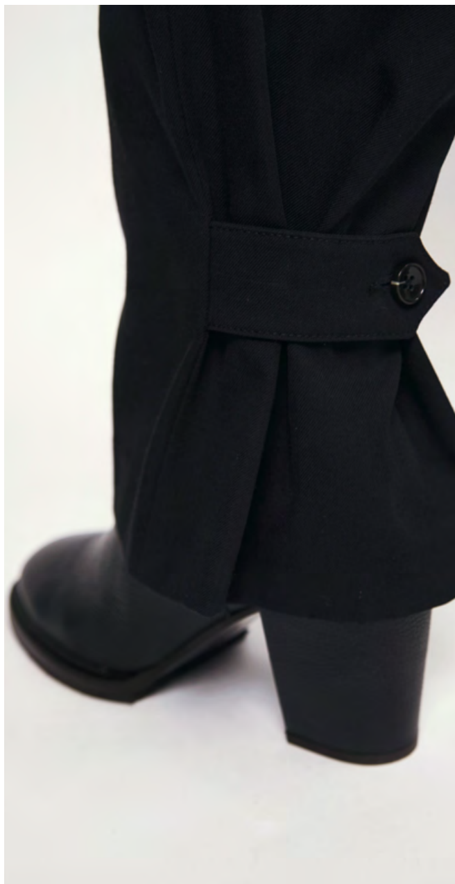
D6HARLOW CARGO PANTS D6AVA LEATHER ANKLE BOOTS