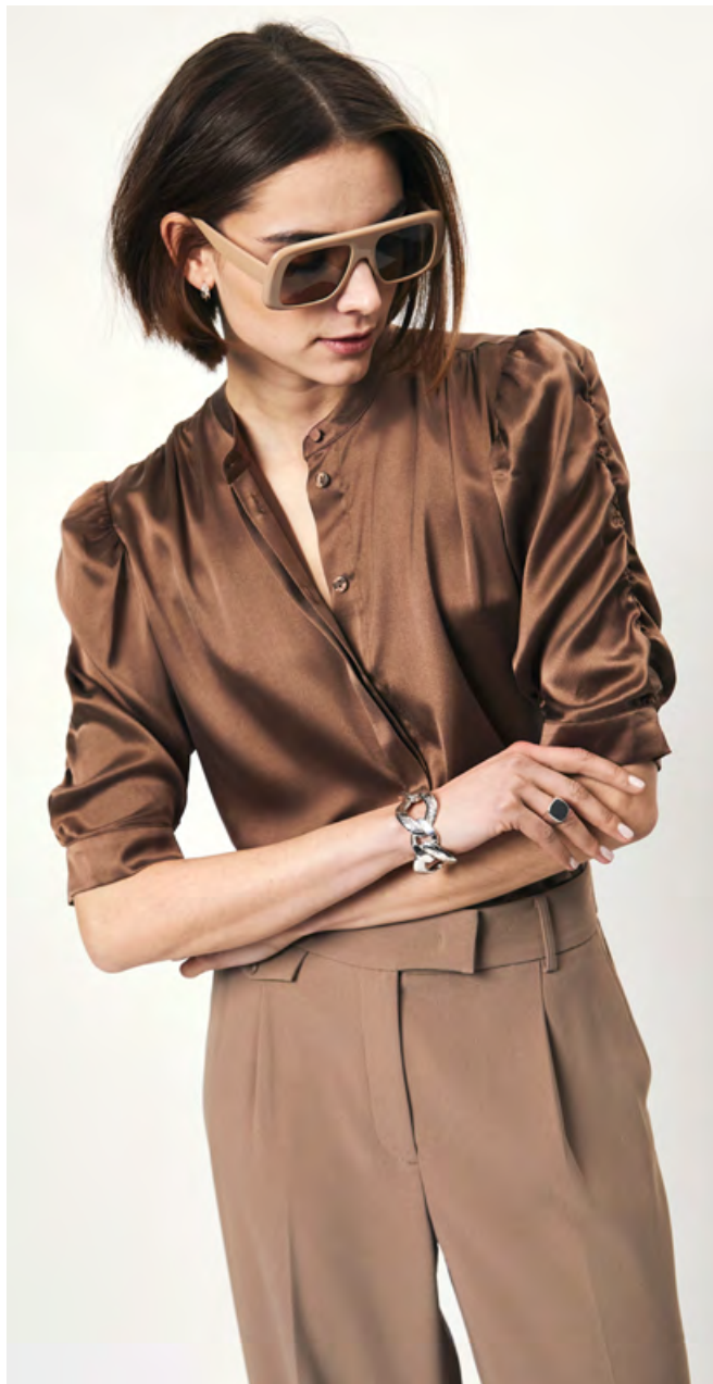
D6PERNAUD BLOUSE D6ZACH PANTS