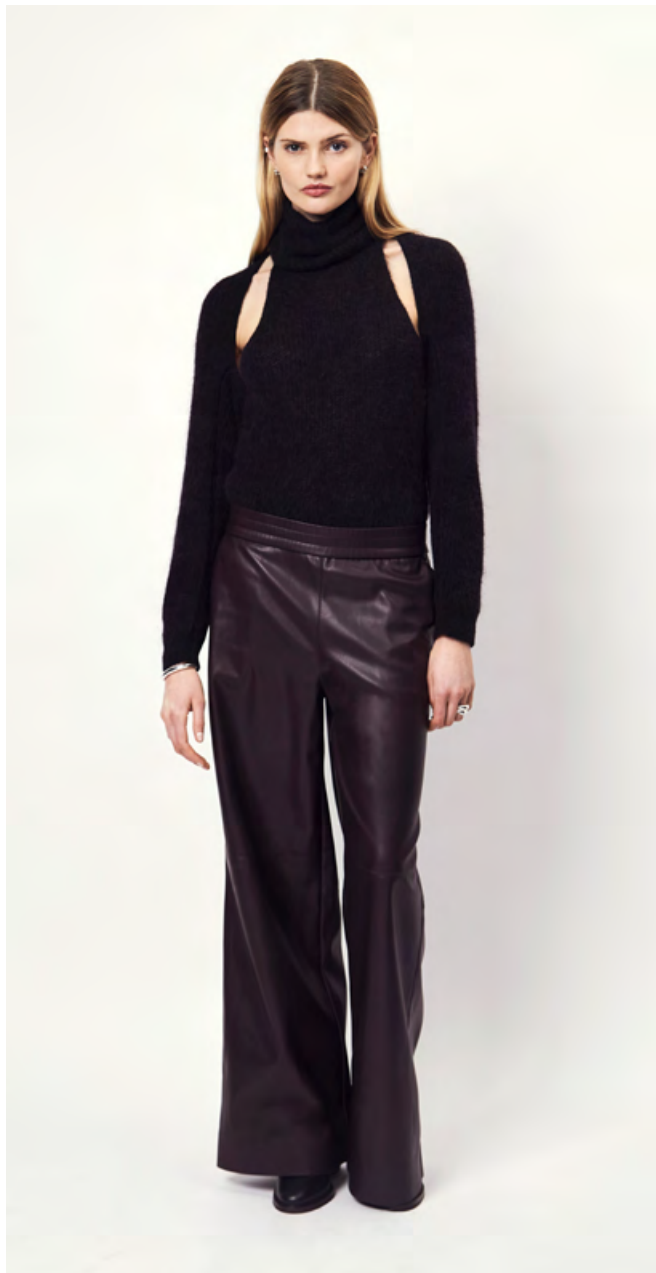
D6JUNIPER BALERO D6YALENA HALTER KNIT D6BASKERVILLE FAUX LEATHER PANTS D6AVA LEATHER ANKLE BOOTS