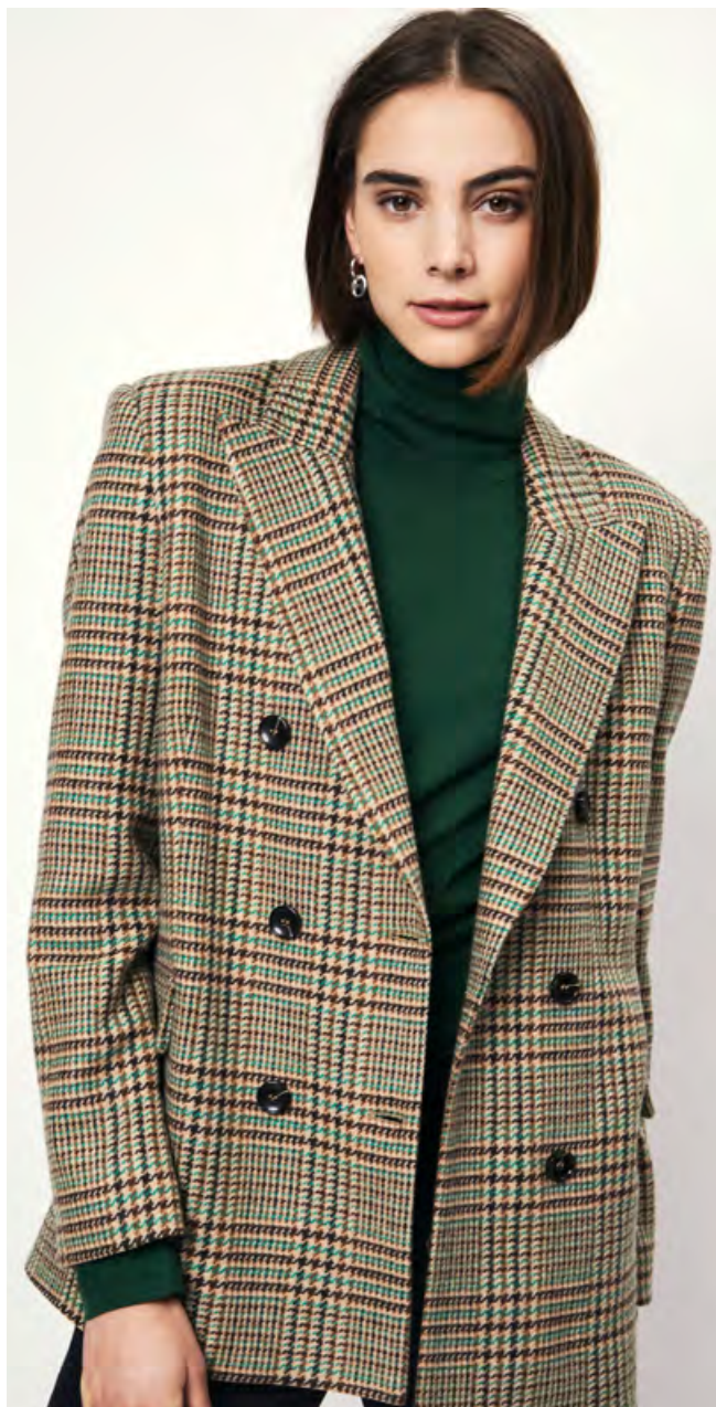
D6LARYN TOP D6VELLUM BLAZER