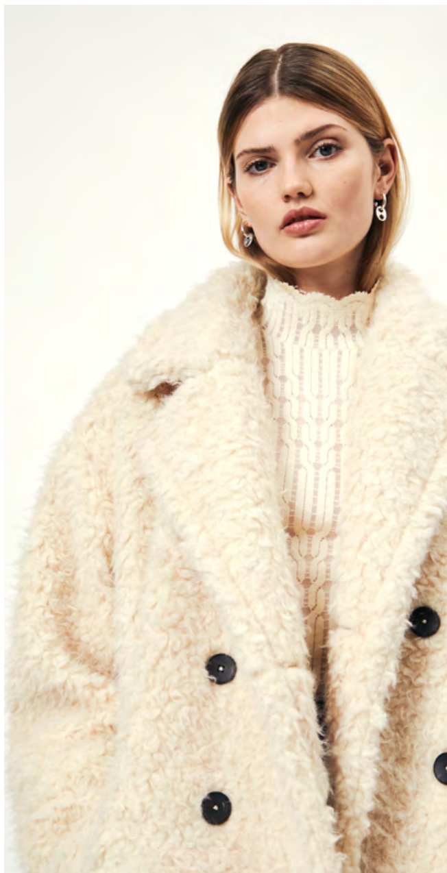
D6NIXON COAT D6COMO LONGSLEEVE