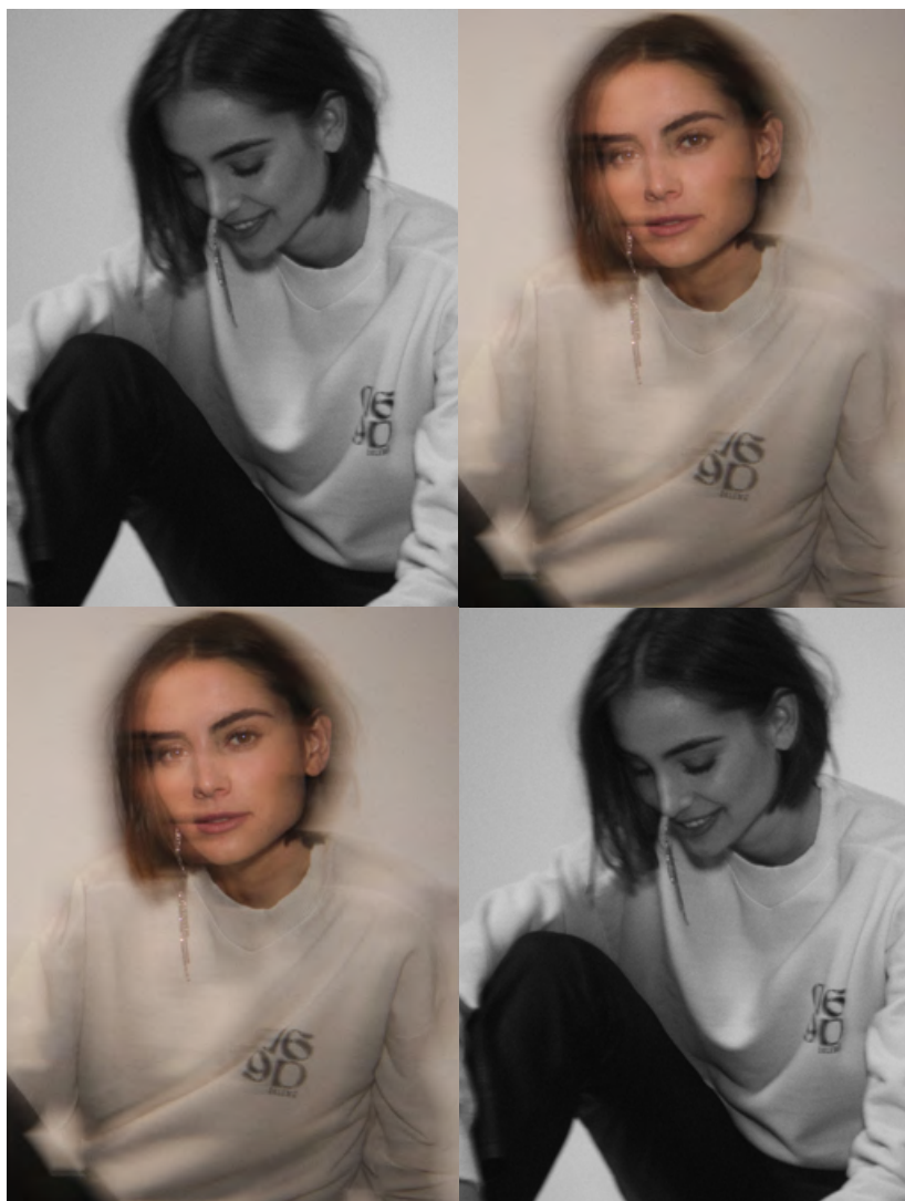
D6RHETT SWEATER, D6RYDER LEATHER CARGO PANTS