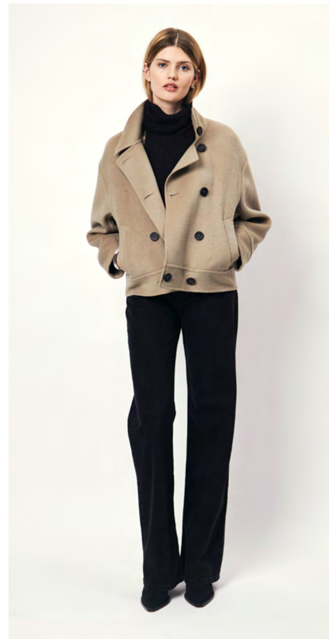
D6WILDER COAT D6YALENA HALTER KNIT D6DOYLÉ PANTS D6SIOUX SUEDE ANKLE BOOTS