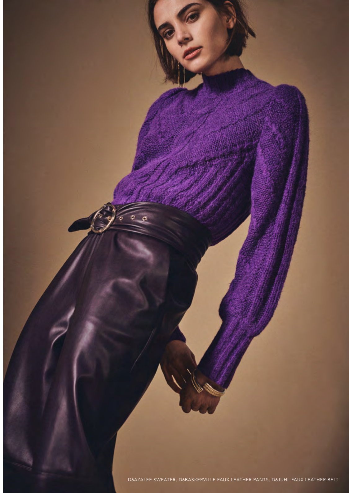
D6AZALEE SWEATER, D6BASKERVILLE FAUX LEATHER PANTS, D6JUHL FAUX LEATHER BELT