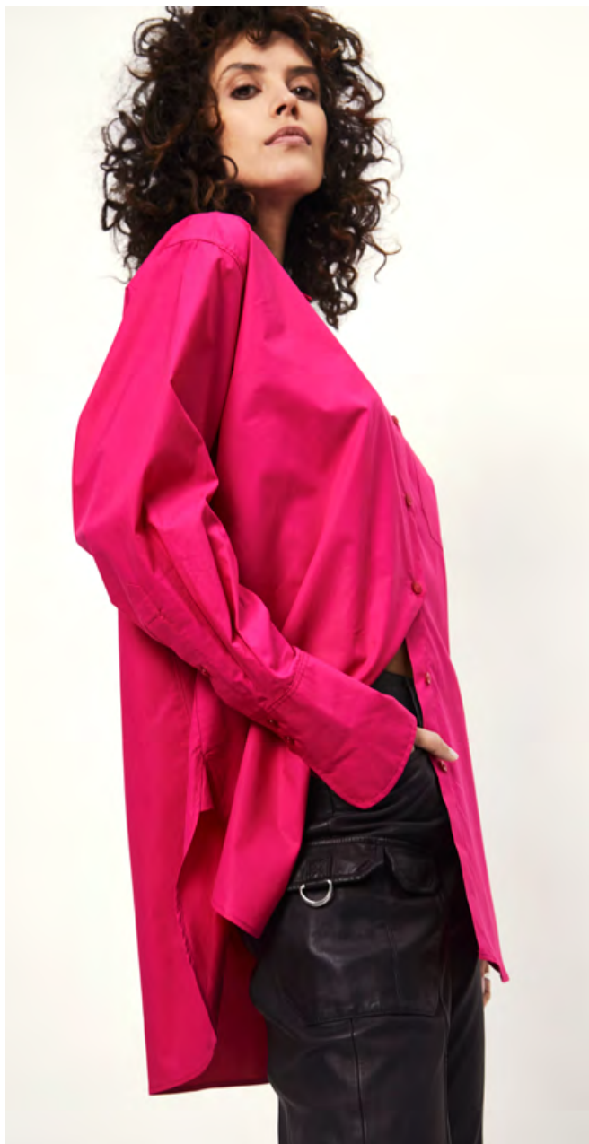
D6ETHAN OVERSIZED BLOUSE D6RYDER LEATHER CARGO PANTS