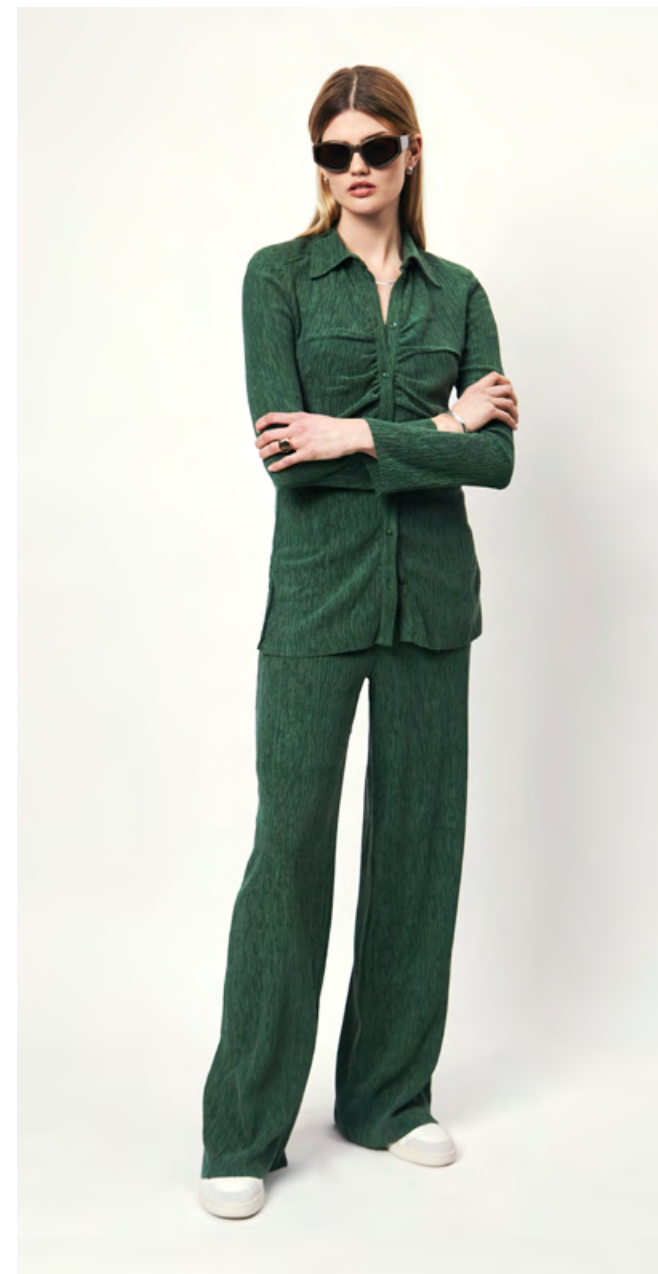
D6CANDICE SHIRT D6HOYS PANTS