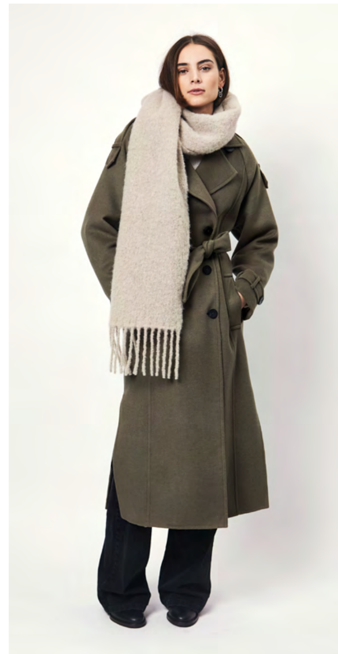
D6RANGER TRENCHCOAT D6NADJA JEANS D6ARIZONA SCARF D6AVA LEATHER ANKLE BOOTS