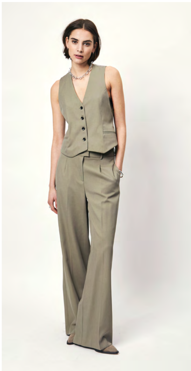
D6MELVA VEST D6DOYLÉ PANTS D6SIOUX SUEDE ANKLE BOOTS