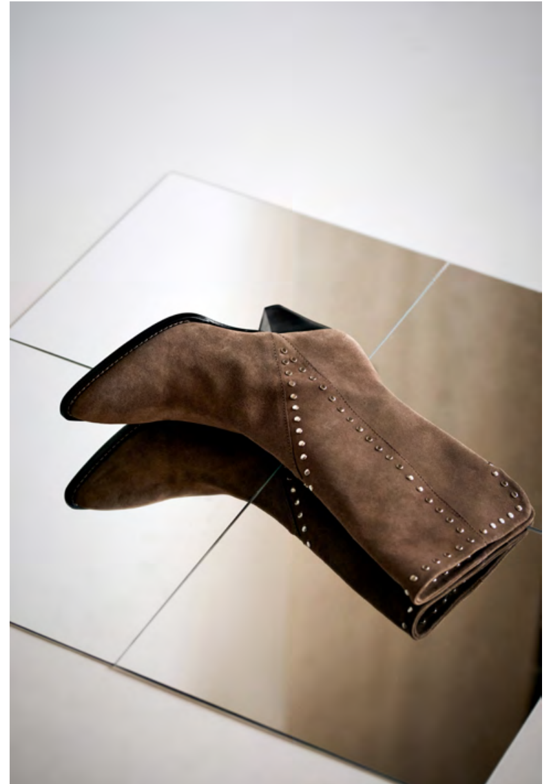
D6GINGER STUDED BOOTS