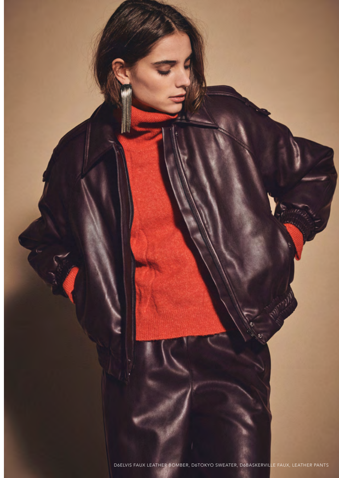
D6ELVIS FAUX LEATHER BOMBER, D6TOKYO SWEATER, D6BASKERVILLE FAUX, LEATHER PANTS