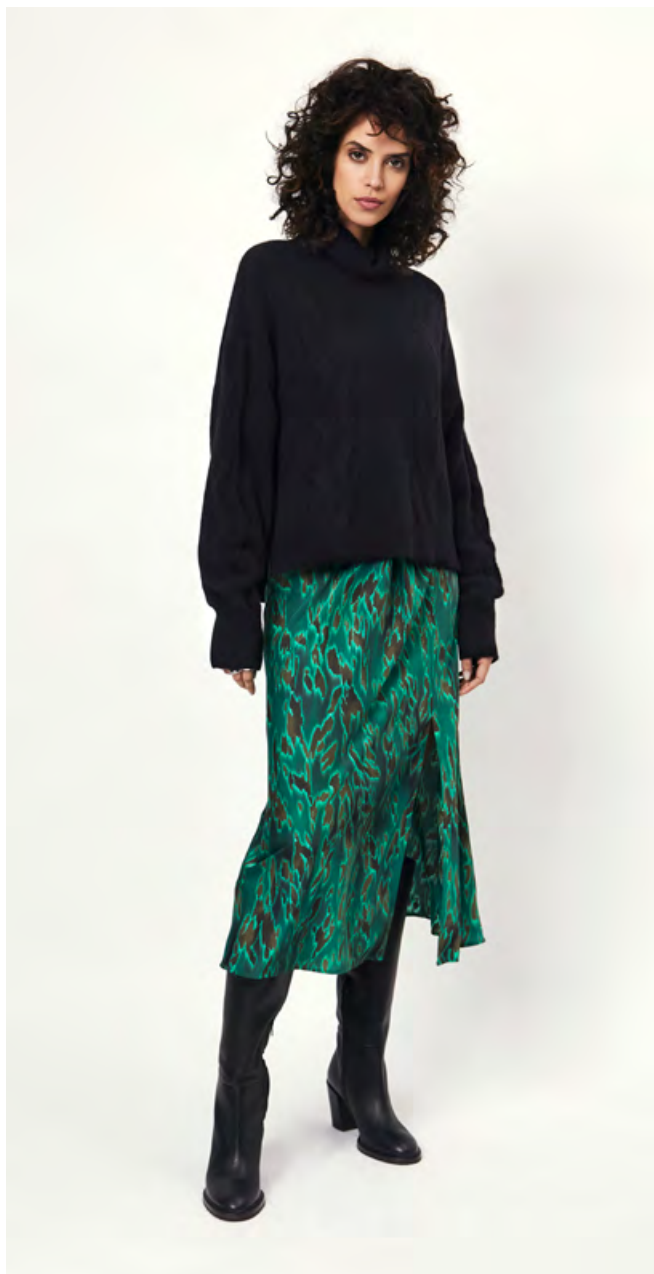
D6TOKYO SWEATER D6ZARINA SKIRT D6WILLOW LEATHER KNEE BOOTS