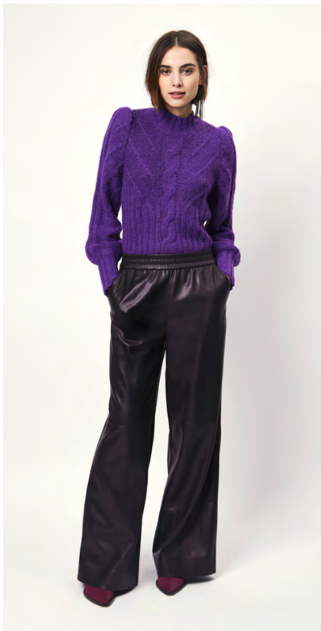
D6AZALEE SWEATER D6BASKERVILLE FAUX LEATHER PANTS D6KAIA SUEDE STUDED BOOTS