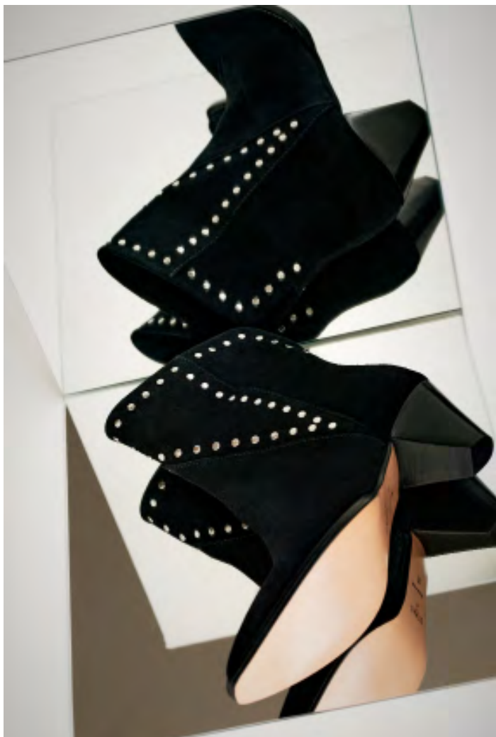
D6KAIA SUEDE STUDED ANKLE BOOTS