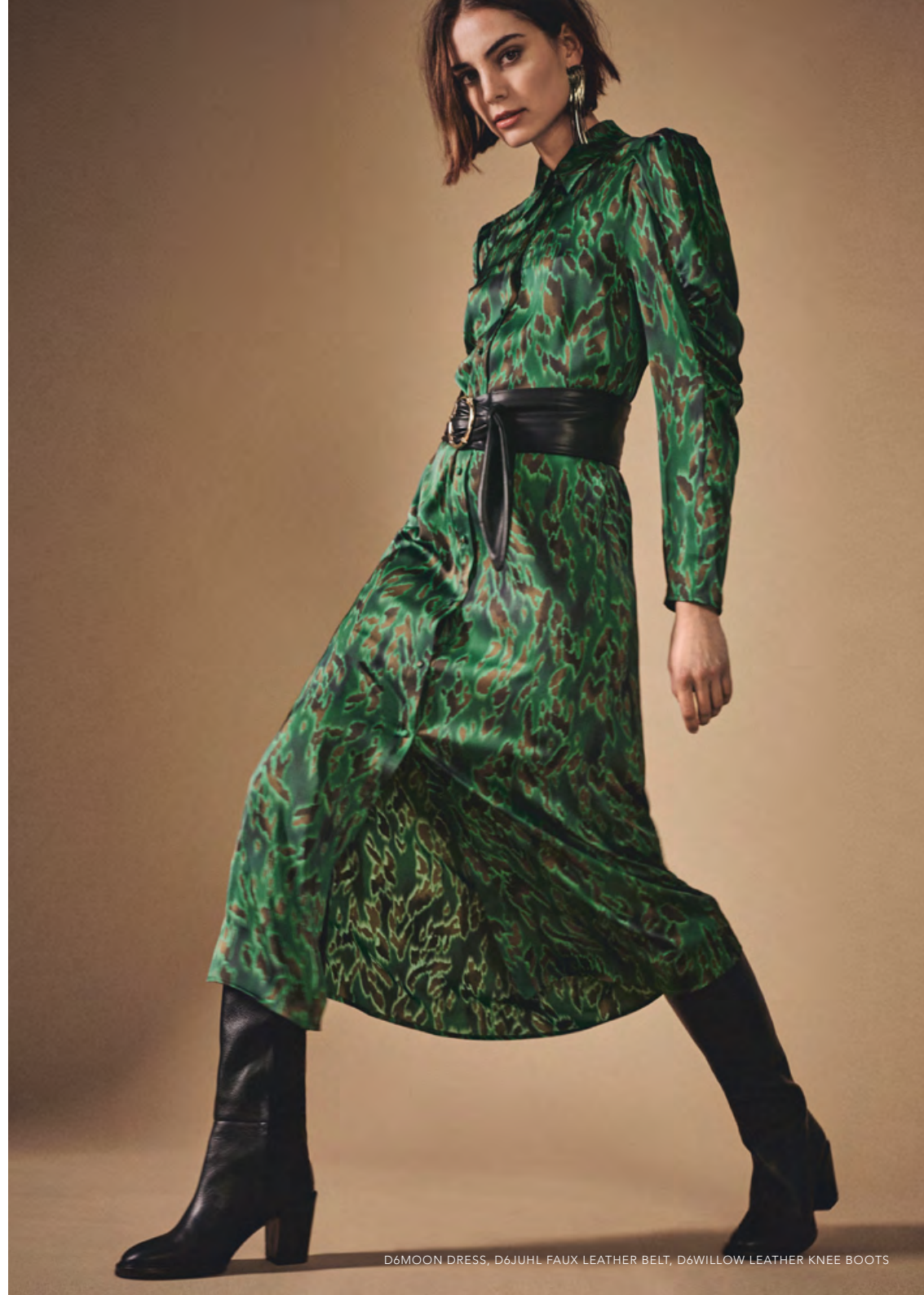
D6MOON DRESS, D6JUHL FAUX LEATHER BELT, D6WILLOW LEATHER KNEE BOOTS