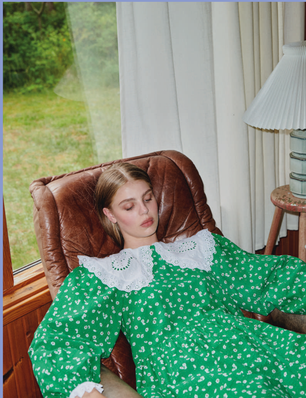
ENBJORK LS DRESS AOP