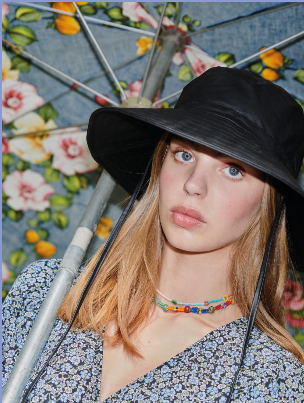
ENCOLOMBINE LS SHORT DRESS AOP