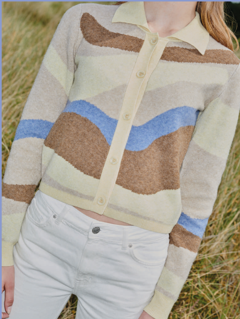
ENNETTE LS CARDIGAN