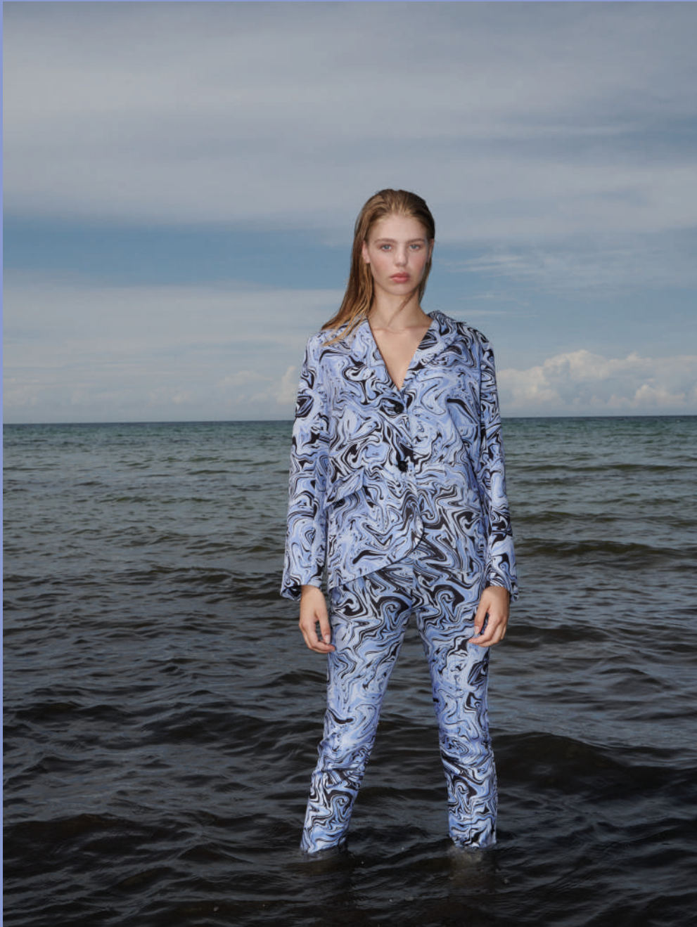
ENHORSE PANTS AOP