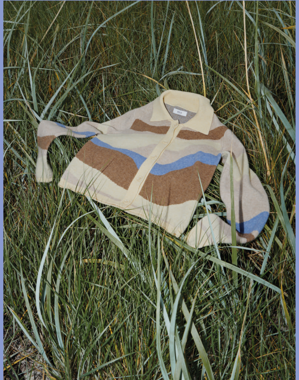
ENNETTE LS CARDIGAN