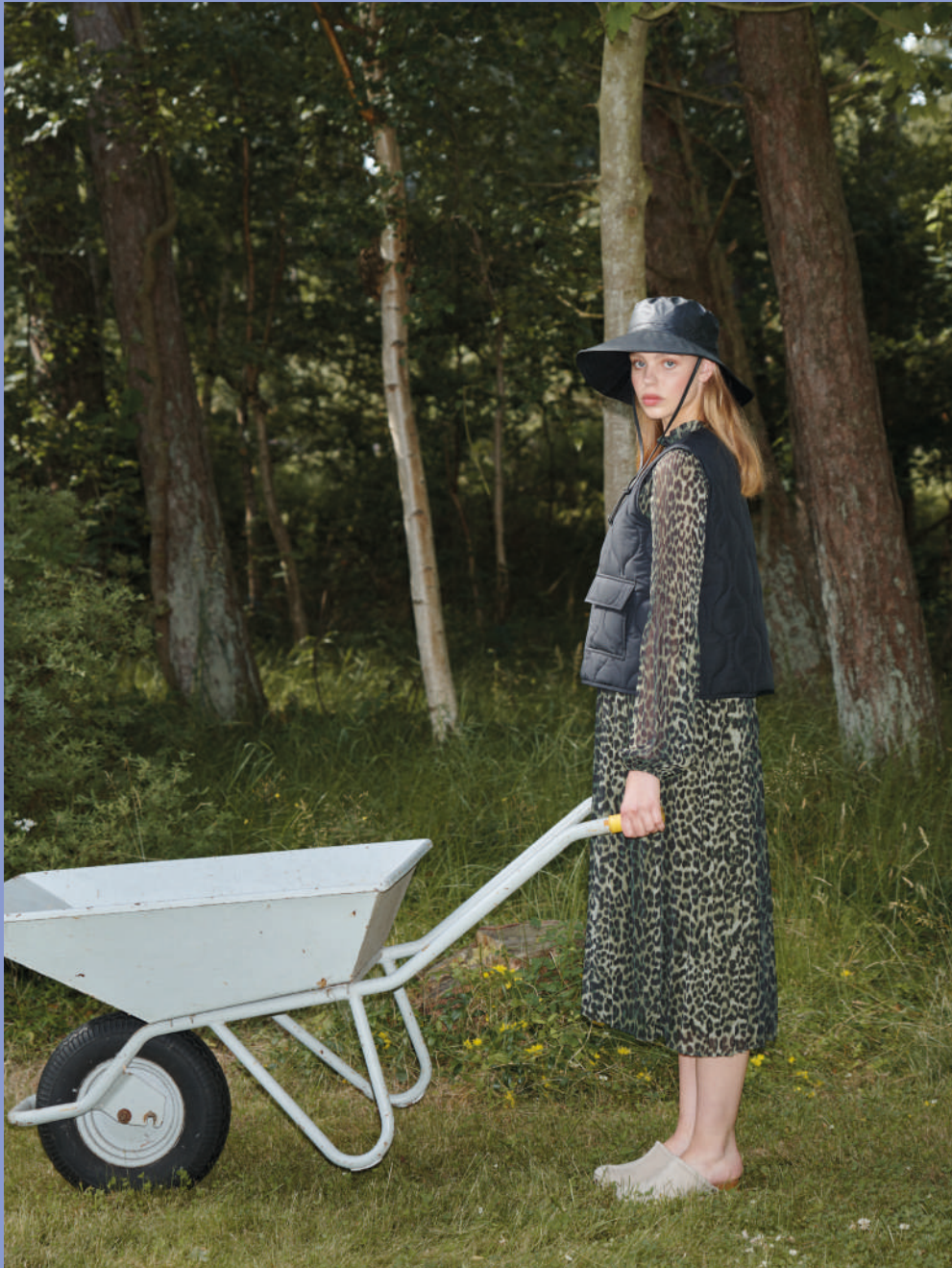
ENROY LS T-N DRESS AOP