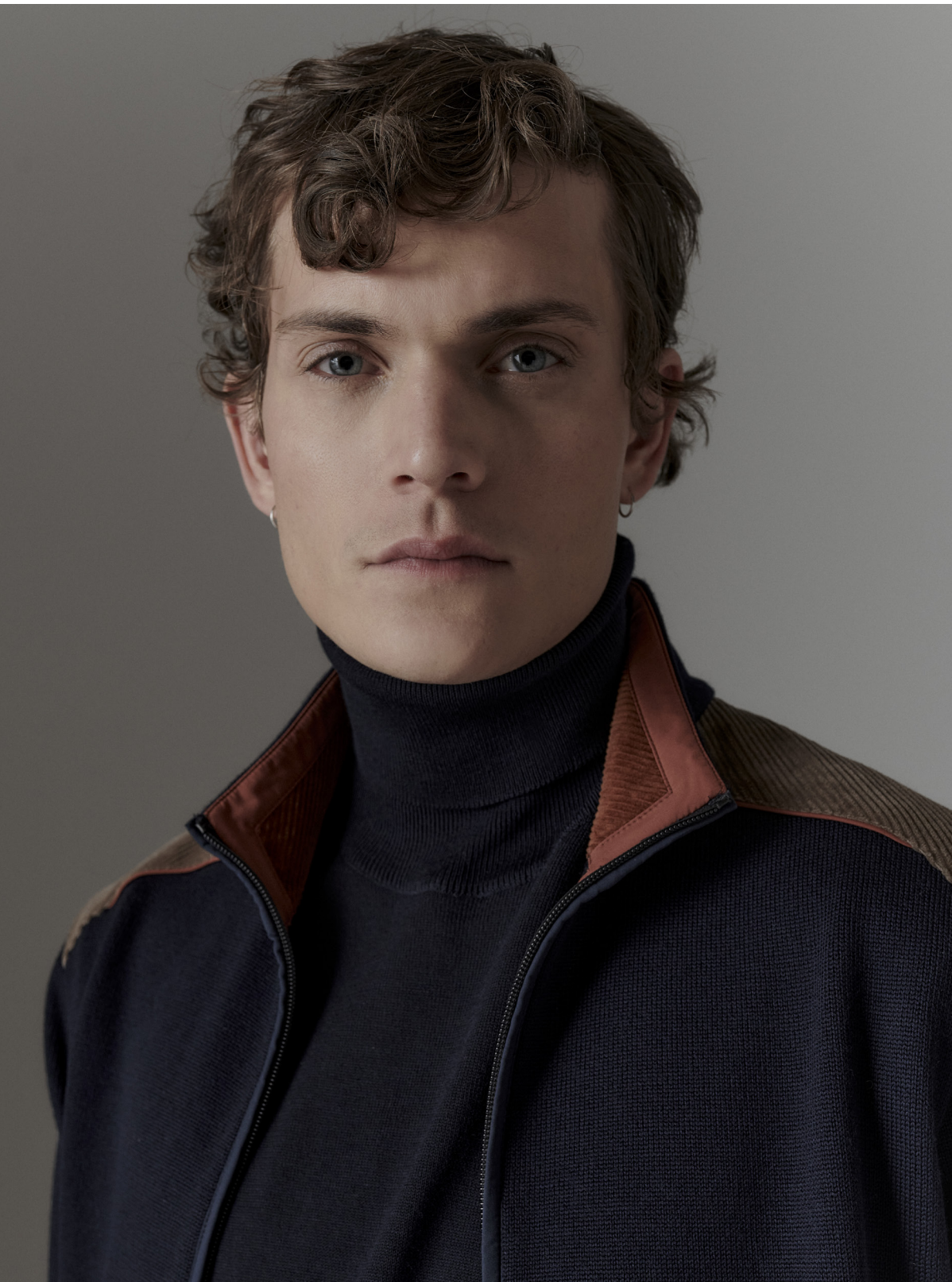
LOOK 09 14311232.050 Wool full zip sweater with corduroy details and moon badge C0PI042.050 Wool turtleneck with iconic badge