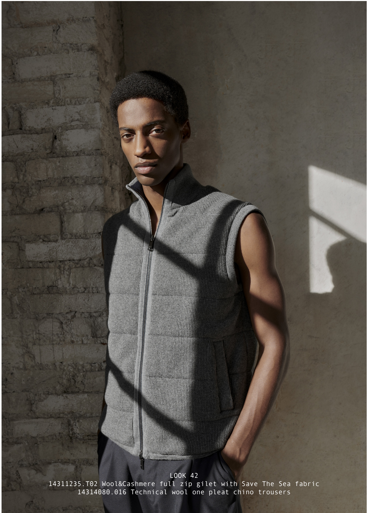
LOOK 42 14311235.T02 Wool&Cashmere full zip gilet with Save The Sea fabric 14314080.016 Technical wool one pleat chino trousers