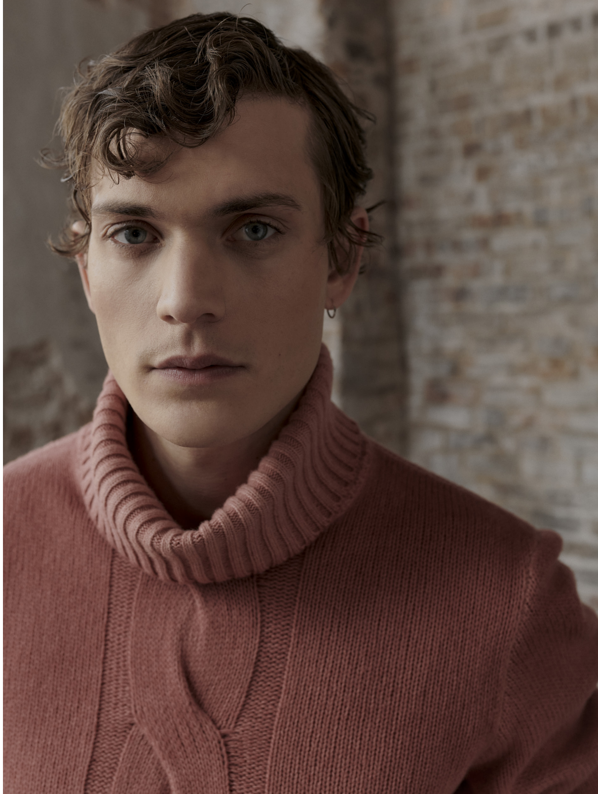
LOOK 32 14311050.201 Garment Dyed Re-Wool Turtleneck With Shark Label